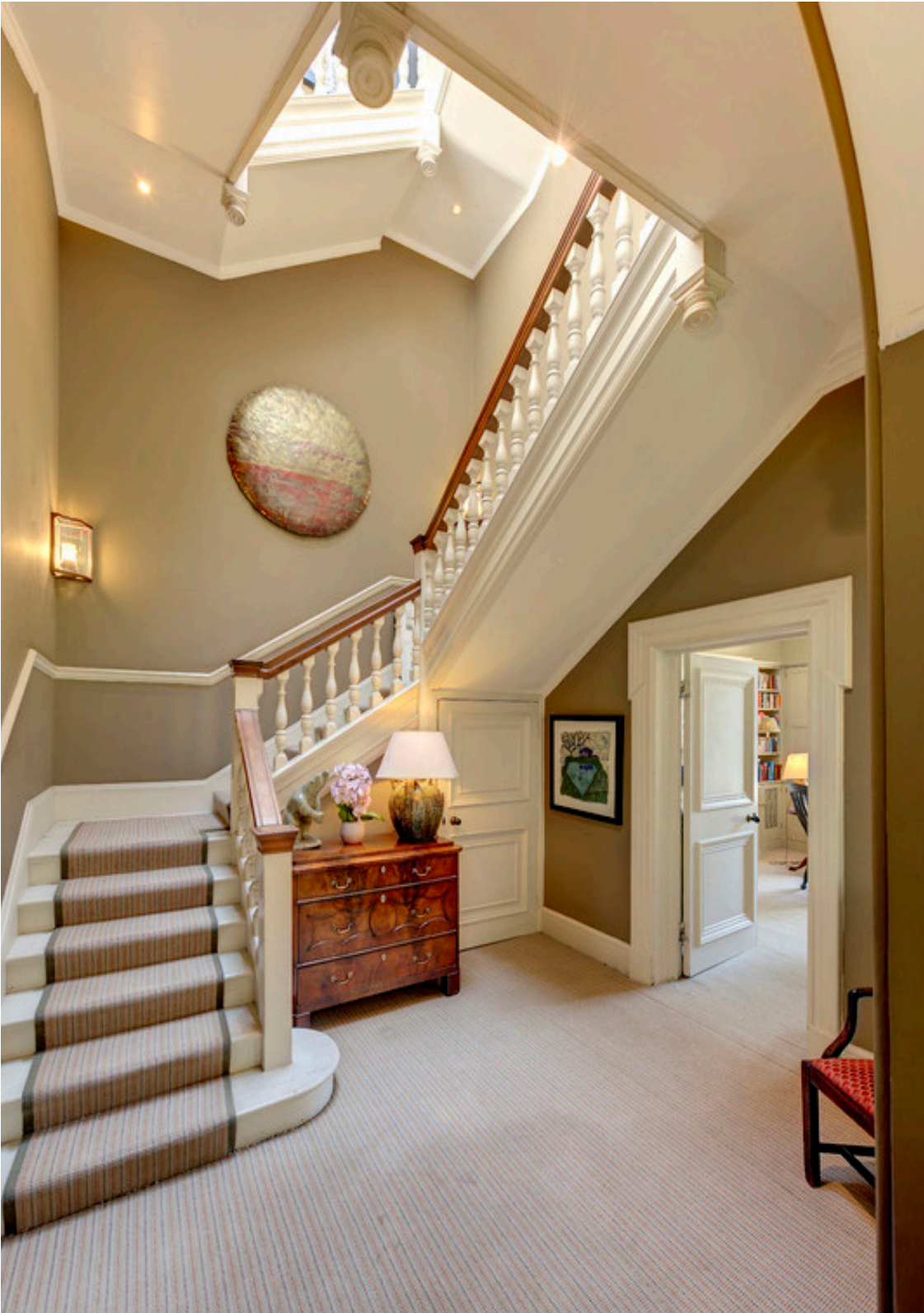
Internal view of upper staircase at Gainsborough Gardens

Pair of semi-detached houses forming part of a small estate. 1884. By EJ May. For HB Timewell. Red brick with stucco dressings and 1st floor band. No.3 has a tiled roof and tile-hung gable and second floor; No.4 has a tiled roof with slate-hung gable and second floor. Tall brick chimney-stacks and white bargeboards, No.4 with dormer. Irregular fenestration, the second floor and attics with sash windows, the lower floors have principal windows with mullion and transom glazing whose upper panes have small lights. No.3 with round-arched, brick and stucco banded porch entrance with enriched keystone and recessed part-glazed door with sidelights. First floor projecting transom and mullion bay window, to right, on large bracket supports. To left, a 2-storey canted oriel, partly tile-hung. No.4 has similar entrance with similar oriel on angle to right and a keyed oculus. INTERIORS: not inspected. HISTORICAL NOTE: drawings for the houses were exhibited at the Royal Academy in 1884. EJ May worked extensively on the Bedford Park Estate, the first major development in the Queen Anne style in London; this has some Queen Anne details but is more monumental in scale. Mr Timewell, a London tailor, lived in No.4 and let No.3. (The Building News: 19 December 1884).. massing here is very different to the earlier C19th development. Houses are sited on generous plots and to a height of only two or three storeys.