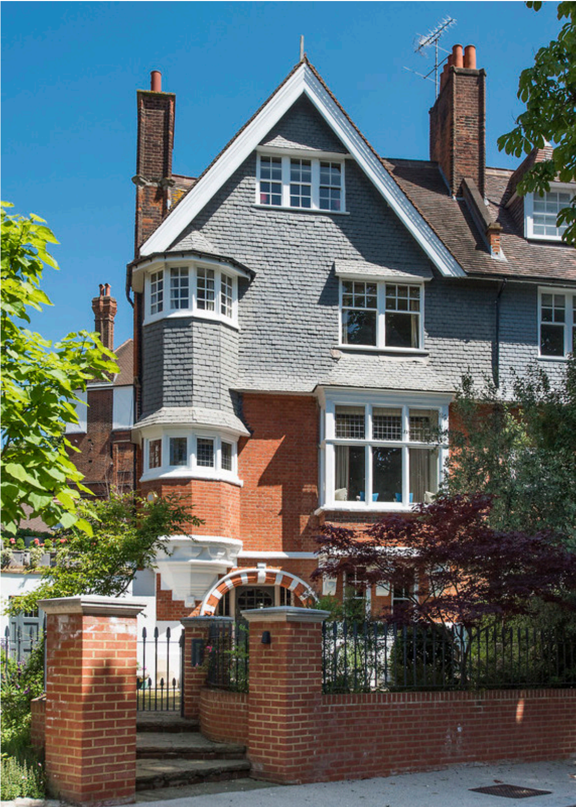
Front entrance to no.3 Gainsborough Gardens

The proposal is to carry out some upgrading and refurbishment to the existing building in preparation for the new owners of the house. The works outlined are minimal and retain the existing plan form of the principal floors. The refurbishment will have little or no impact on the original fabric of the building. We look forward to discussing the proposals with the officers.