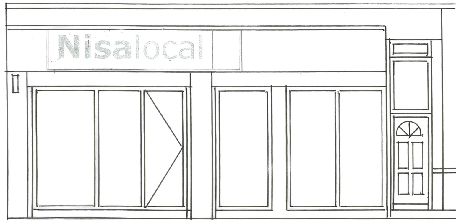
Existing Projecting Sign