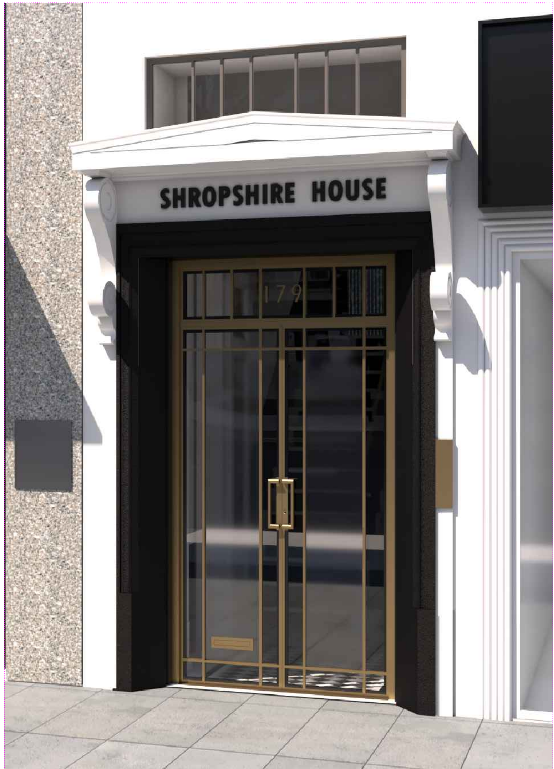
[03] ARTIST IMPRESSION OF FRONT ELEVATION

NOTE: DO NOT SCALE FROM DRAWINGS - EXCEPT FOR PLANNING PURPOSES. ALL DISCREPANCIES TO BE REPORTED TO ARCHITECT IMMEDIATELY. ALL DIMENSIONS TO BE VERIFIED BY CONTRACTOR ON SITE PRIOR TO THE COMMENCEMENT OF ANY WORKS.