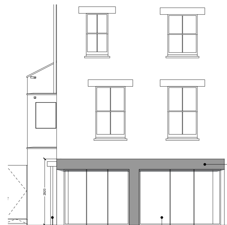
_proposed rear facade