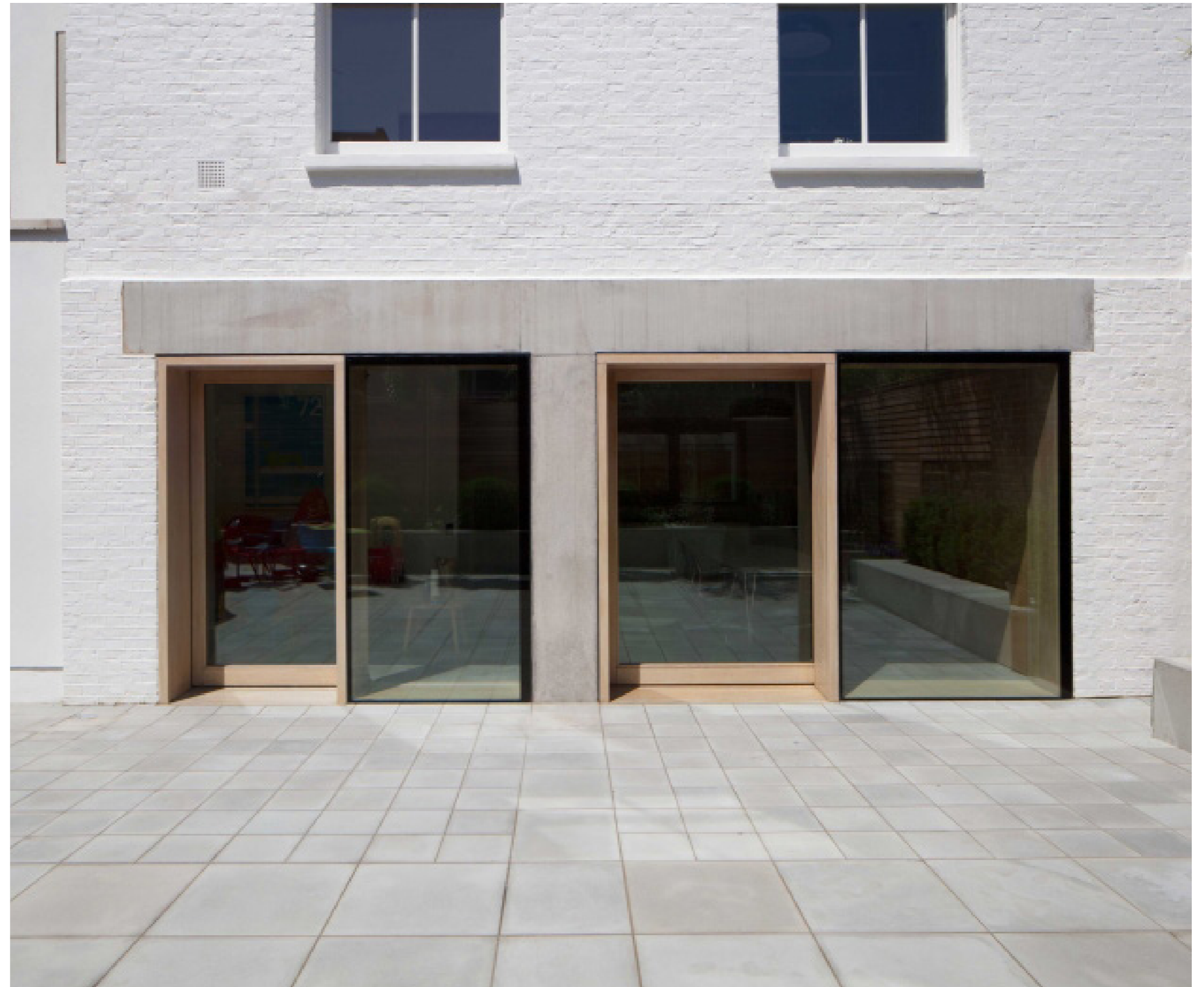
_Rear facade of no.03 Fitzroy Rd

DF_DC have been instructed to prepare and submit proposals for creating a small extension to the rear of the house at 3 Fitzroy Road, having been previously involved in the internal refurbishment. The following document describes the nature of the proposal, design considerations and material definition, complementing the drawing package.