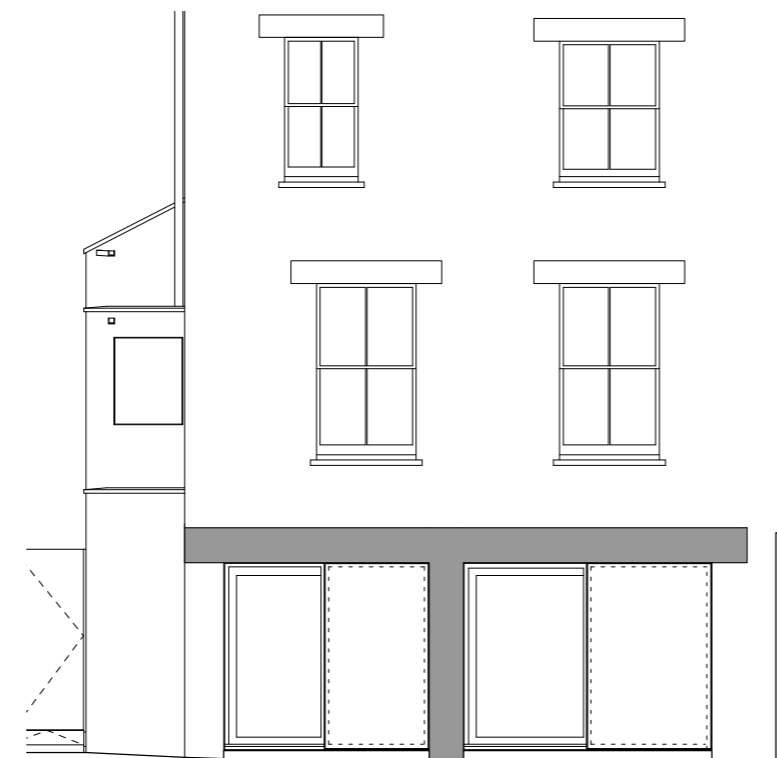
_existing rear facade