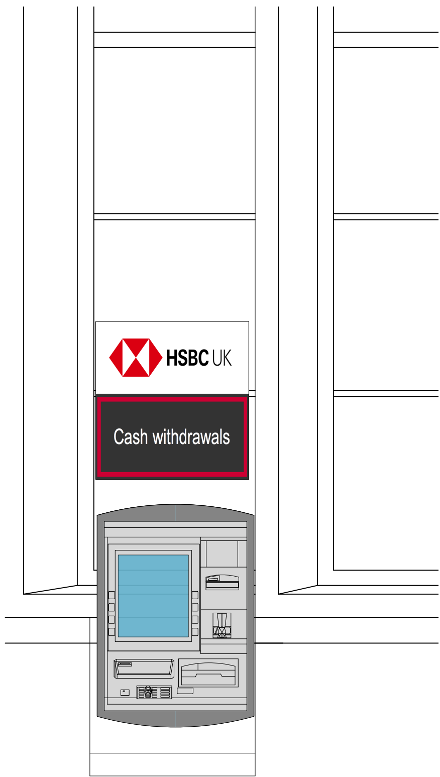
02 Detailed Elevation Of Affected Area 1:25@A3 / 1:12.5@A1