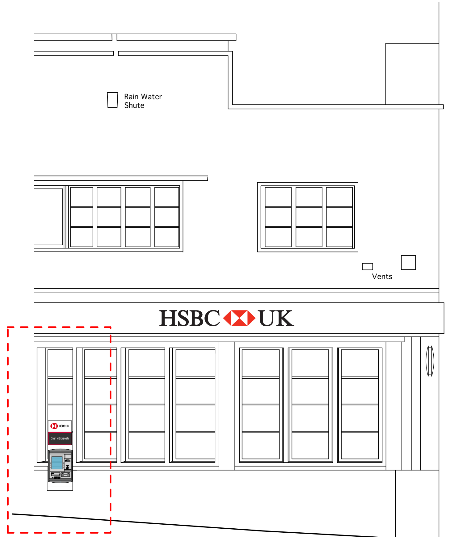
03 External Elevation 1:100@A3 / 1:50@A1