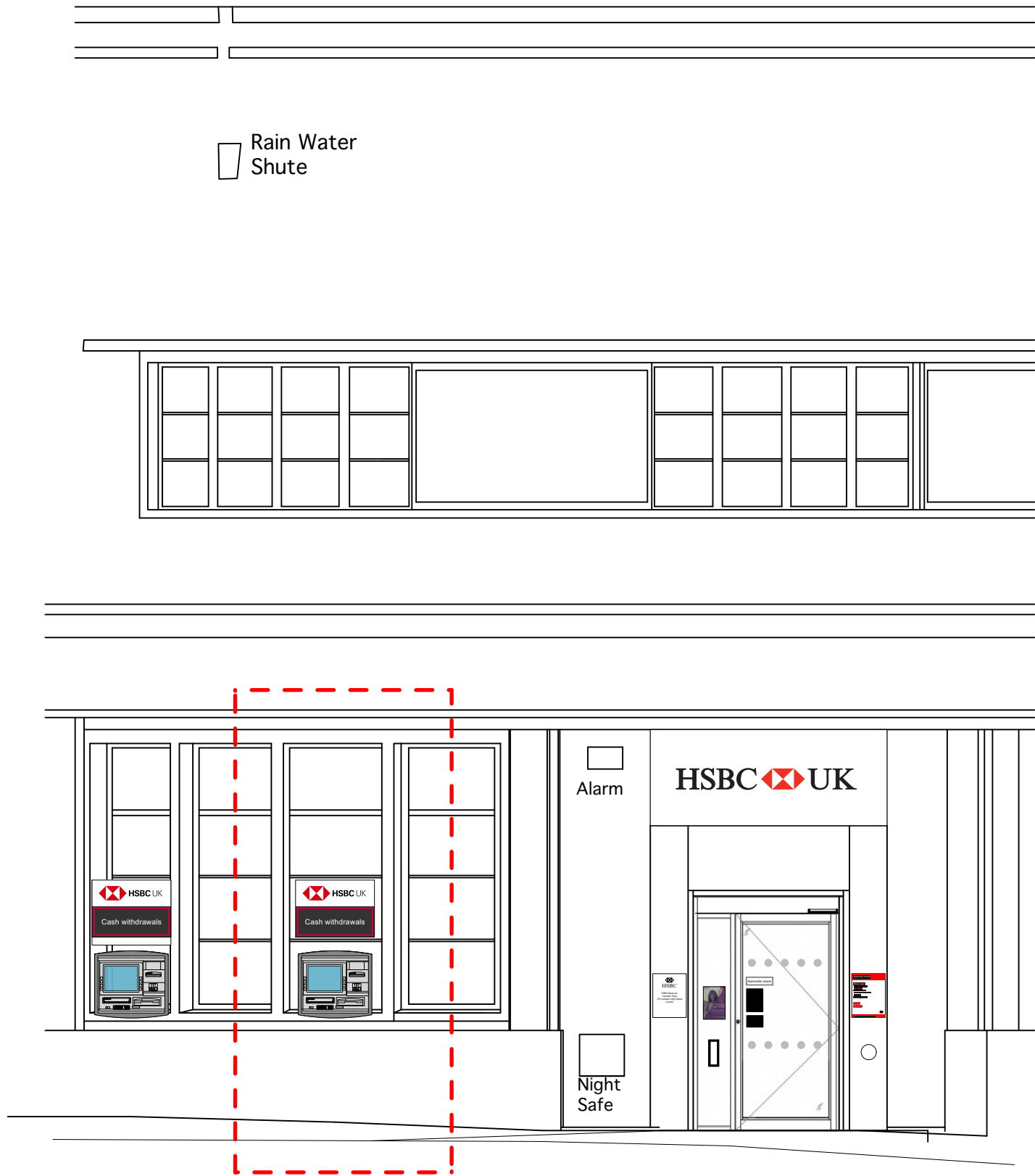
03 External Elevation 1:100@A3 / 1:50@A1