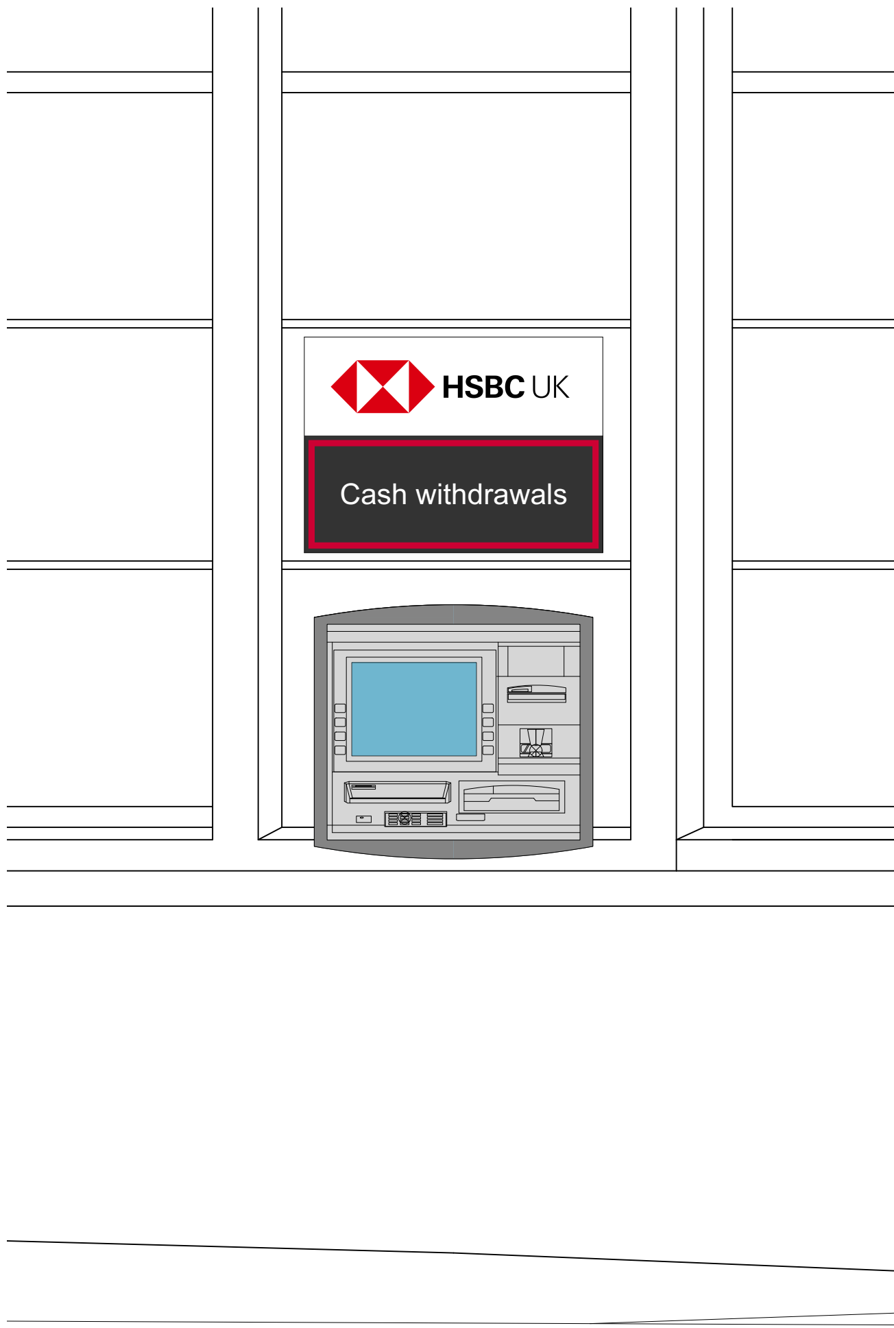
02 Detailed Elevation Of Affected Area 1:25@A3 / 1:12.5@A1