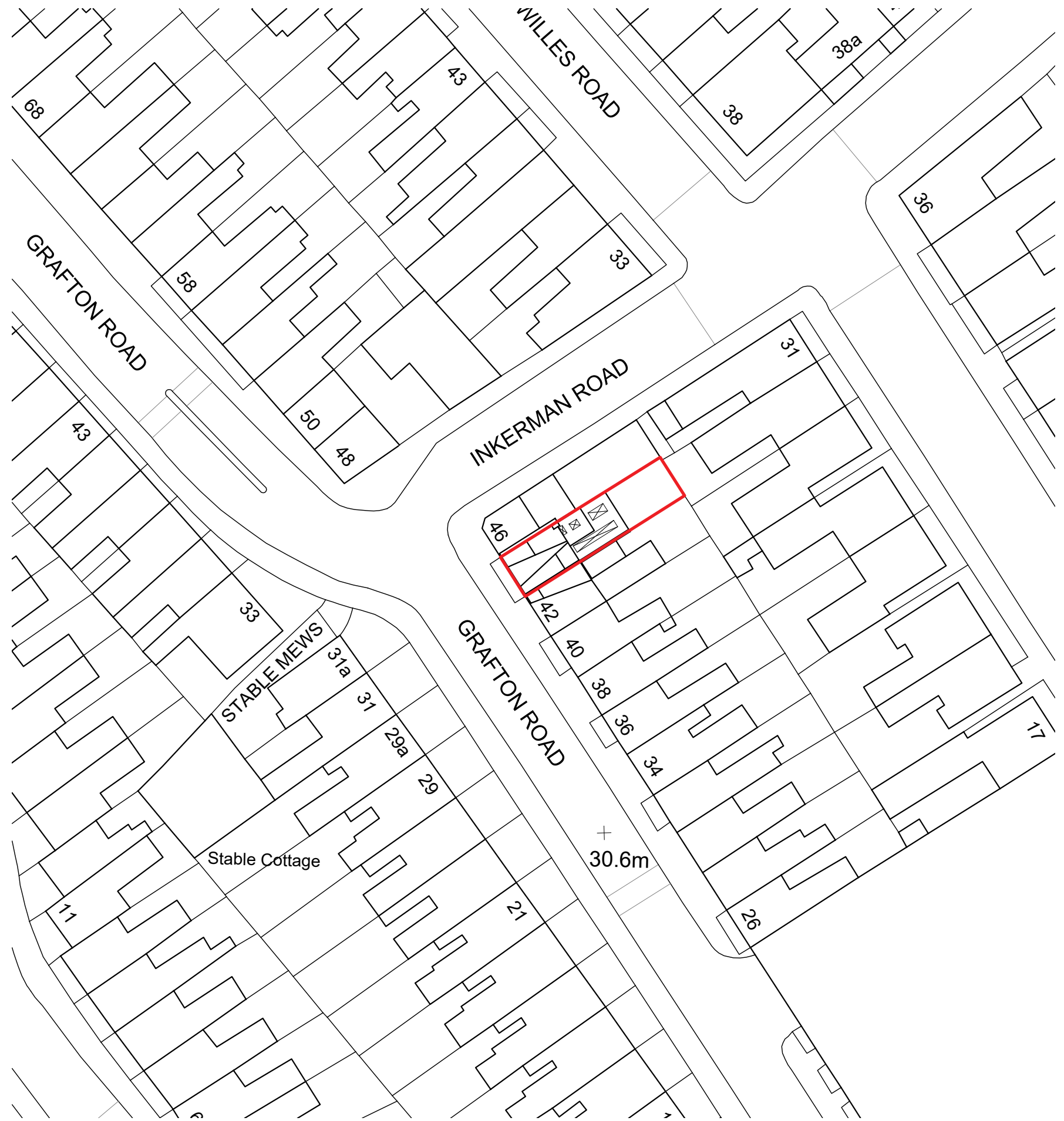
X PROPOSED Block Plan 1:500@A3