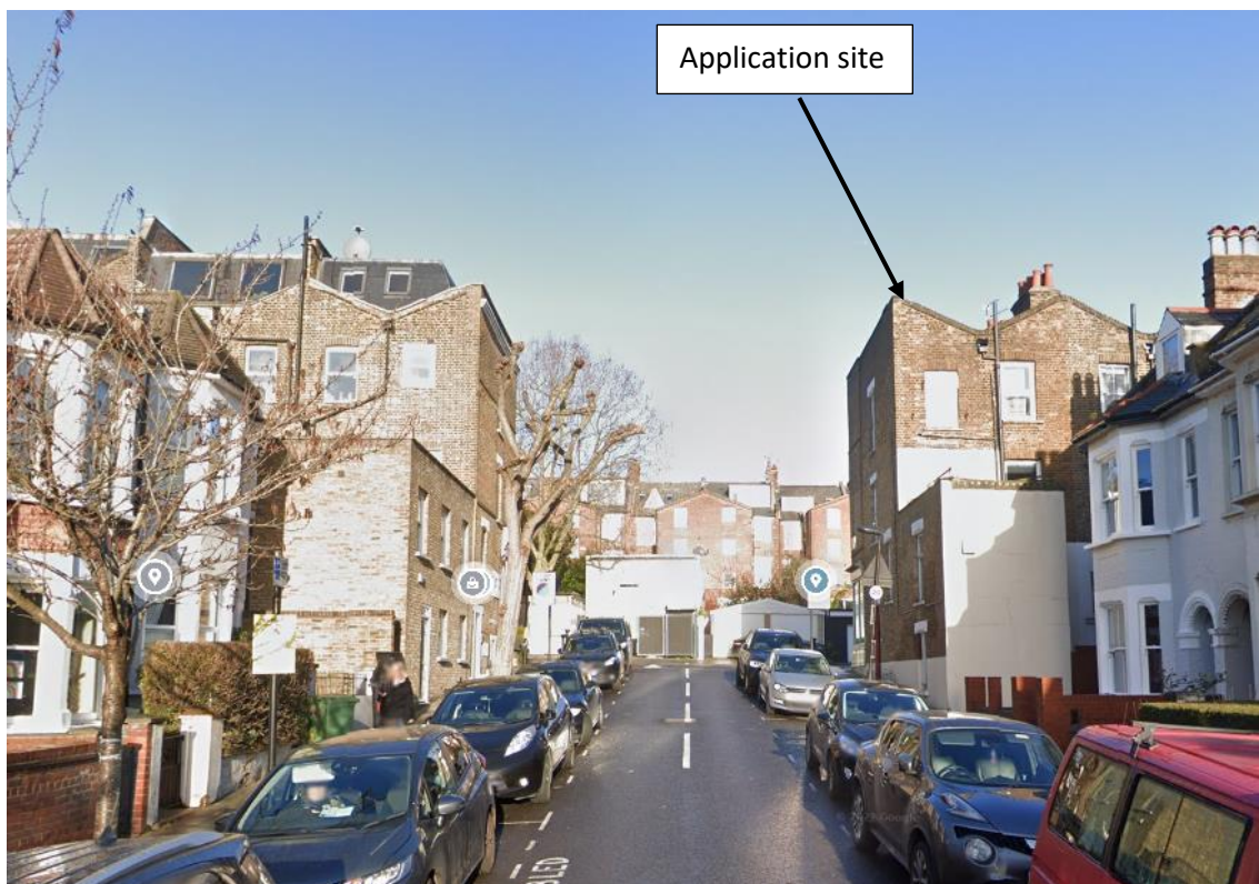
Mansard extensions at nos. 88, 90 and 92 Mill Lane