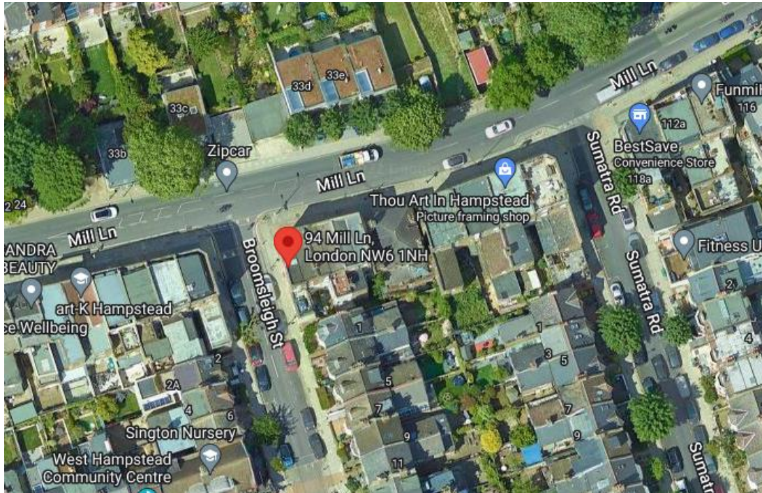
Aerial view of the application site and surrounding area

2.1 The application site is positioned to the south eastern side of Mill Lane adjacent to the junction with Broomsleigh Street. The site forms part of a neighbourhood centre although the surrounding area is predominantly residential in character, however, it is not within a conservation area or within the curtilage of a listed building.