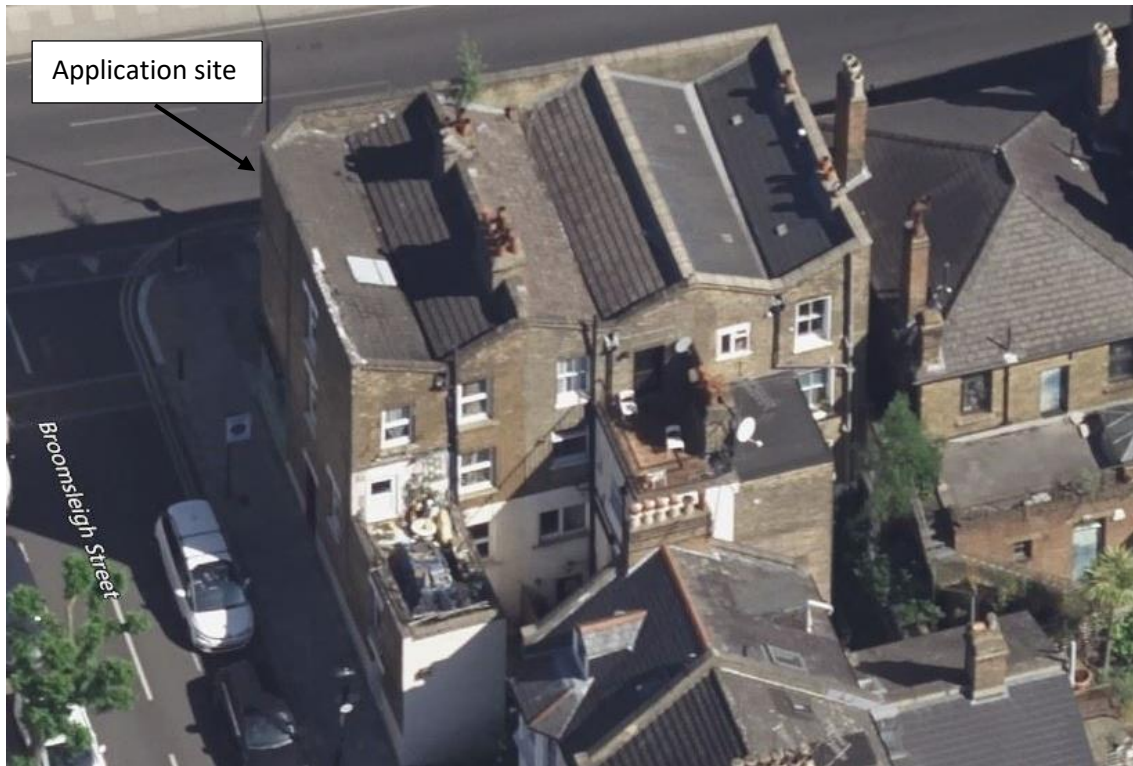
First floor rear extensions at nos. 96 and 98 Mill Lane