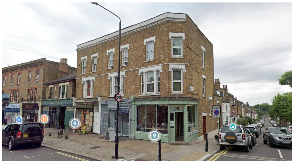
Google street view – no. 94 Mill Lane

2.2 The application relates to the first and second floor of the property which is currently in use as a 2x bedroom self-contained flat.