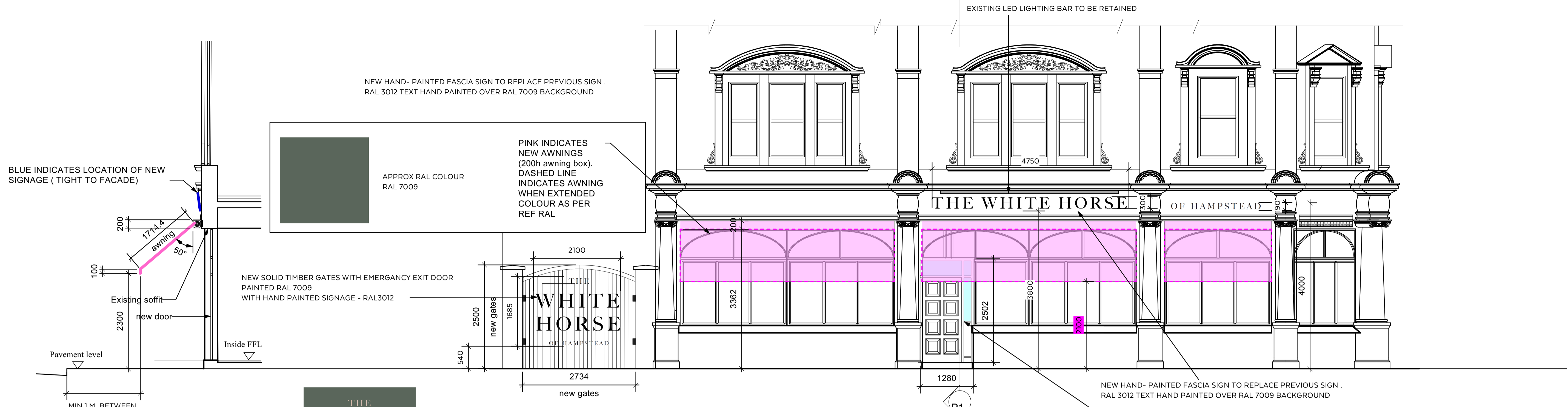
P1 Proposed Section Scale: 1:50