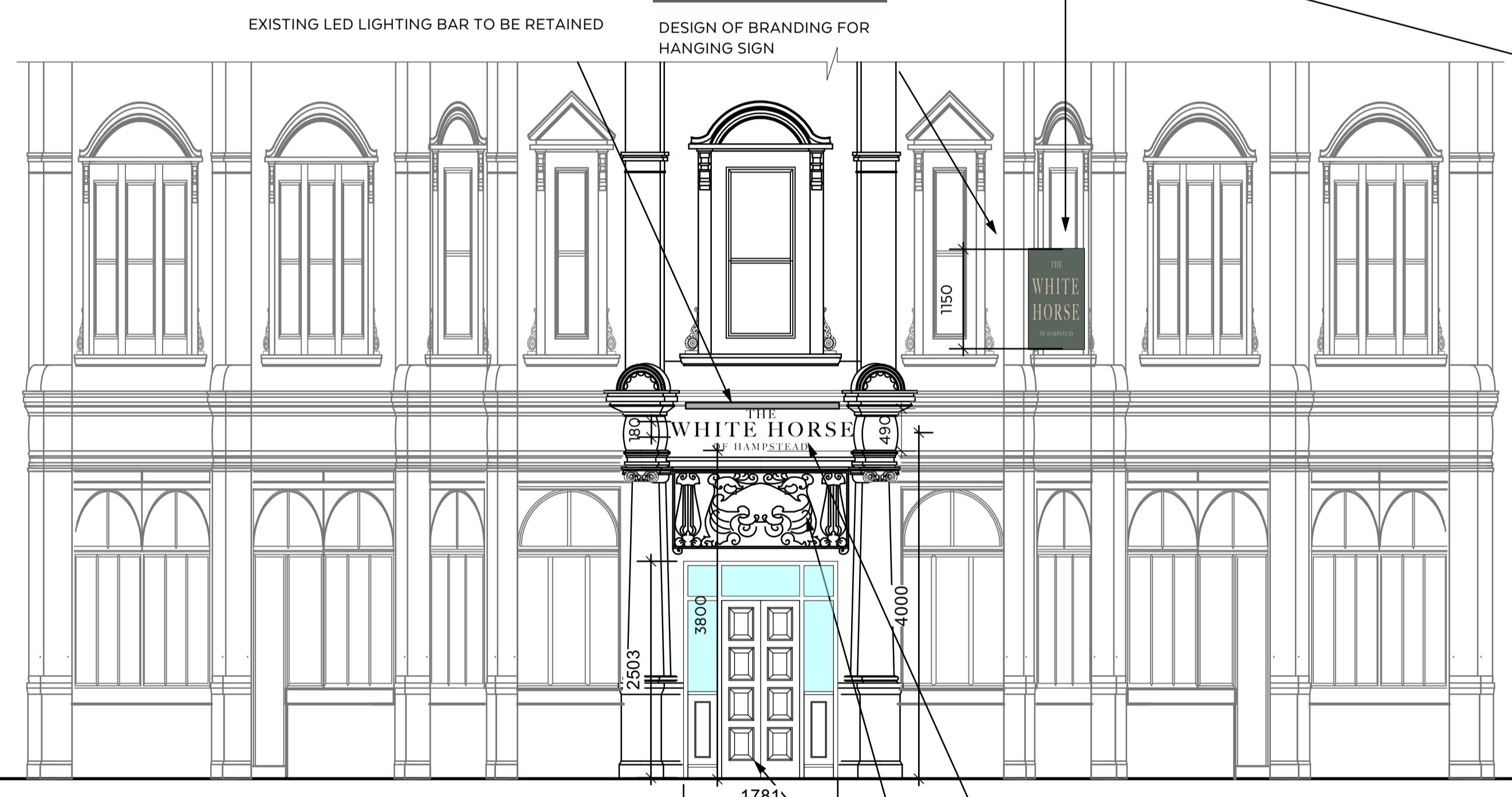
P3 Proposed Front Elevation Scale: 1:50