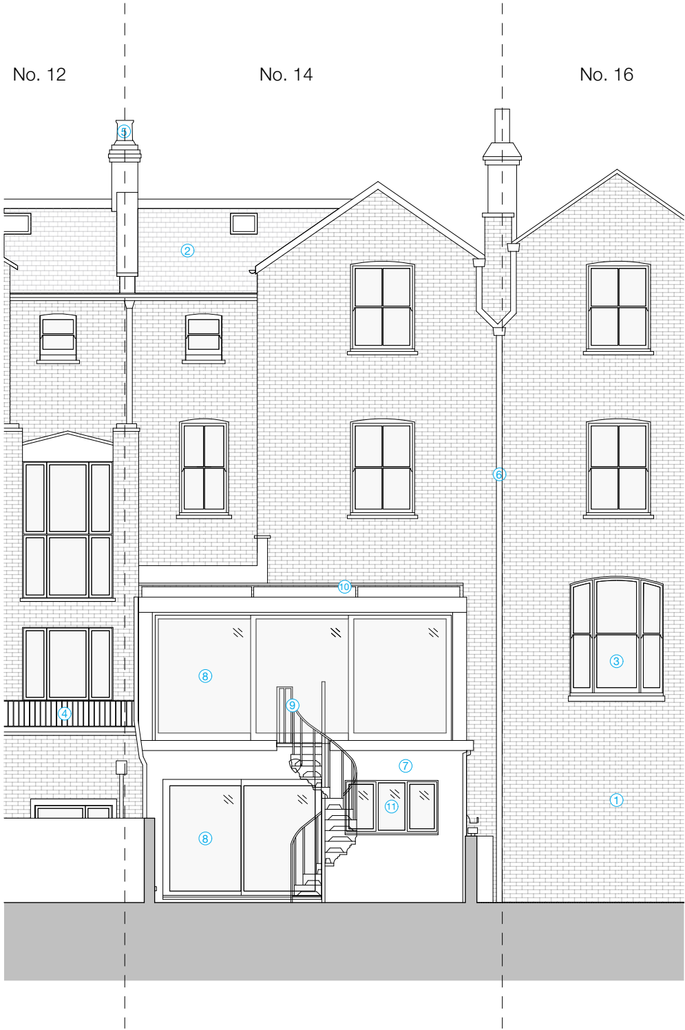
1 Existing North Elevation 1:100