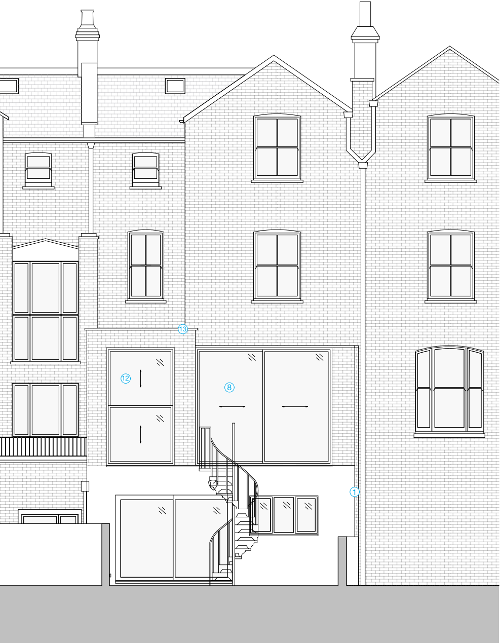
2 Proposed North Elevation 1:100