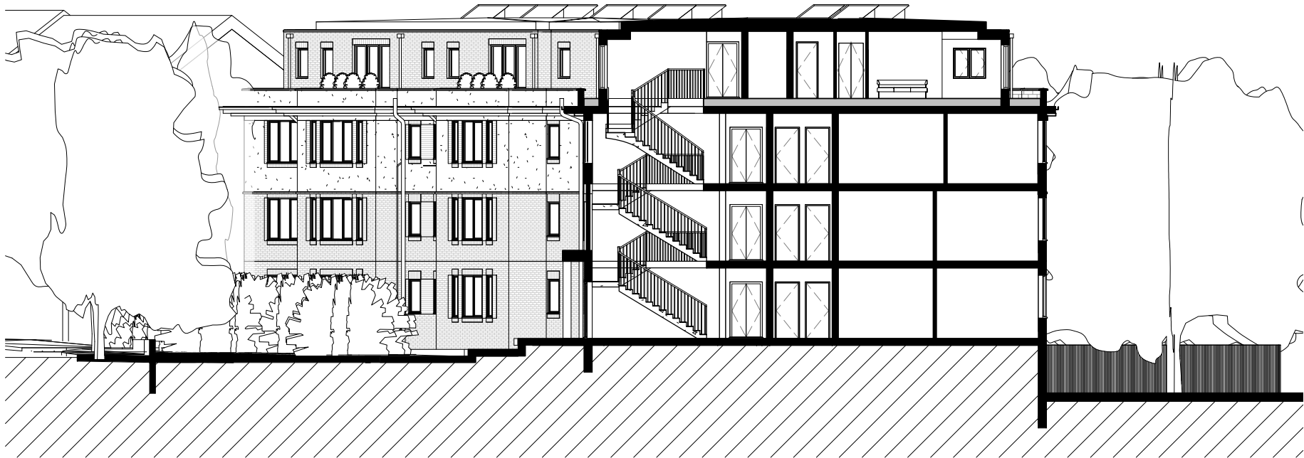
SECTION BB 1:200