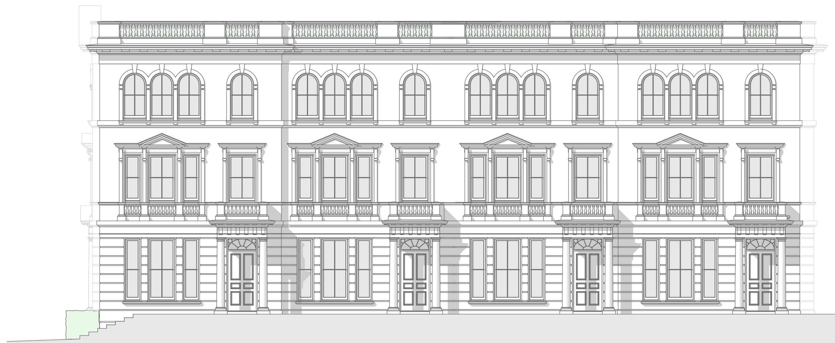
ELEVATION 3 1:100

FRONT DOORS SYMMETRICALLY PLACED WITHIN TERRACES- FENESTRATION ALTERED TO SUIT