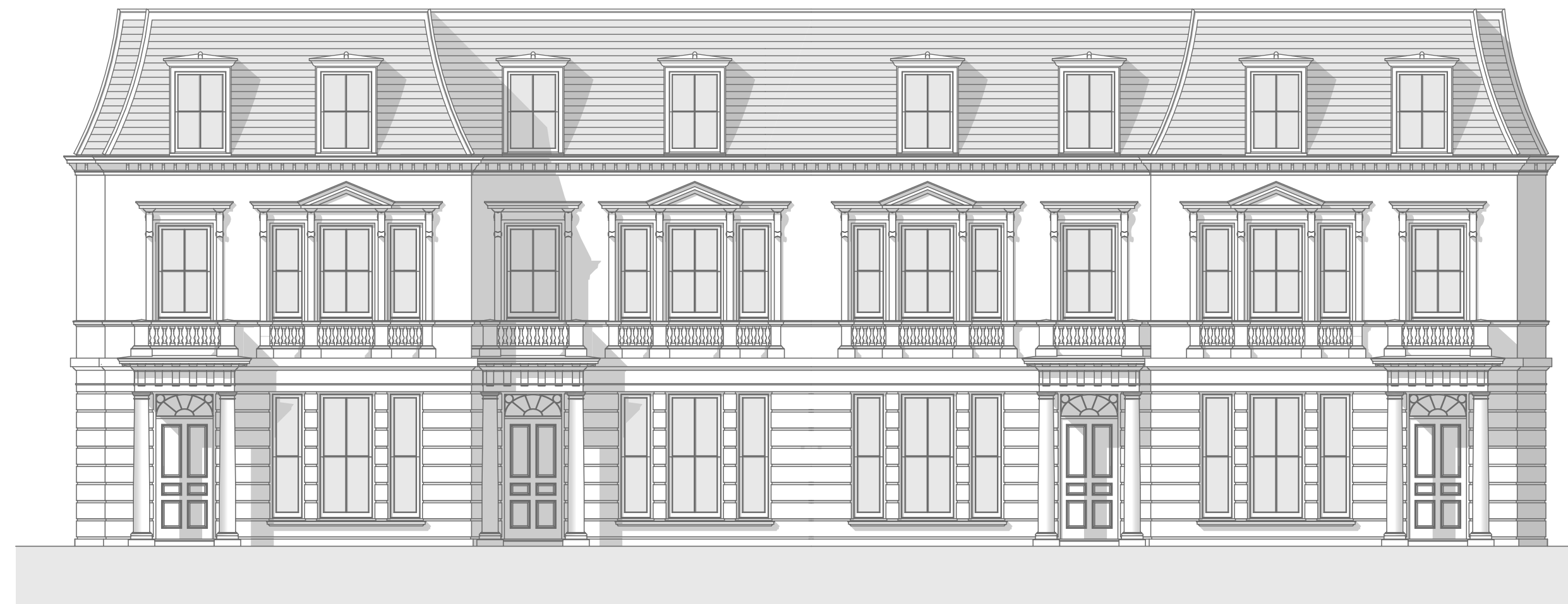
ELEVATION 2 1:100