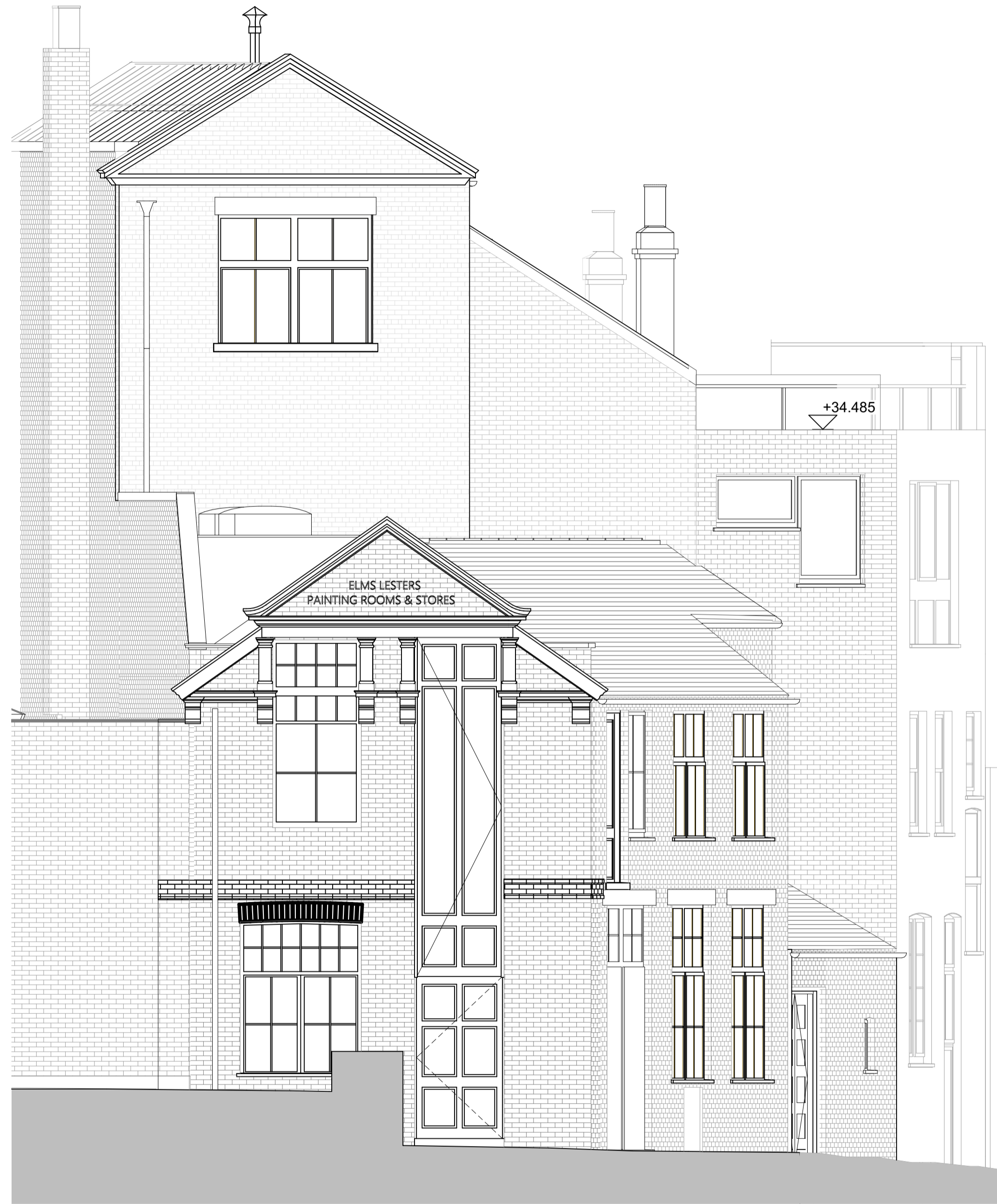
Existing Elevation B 1:50 at A1