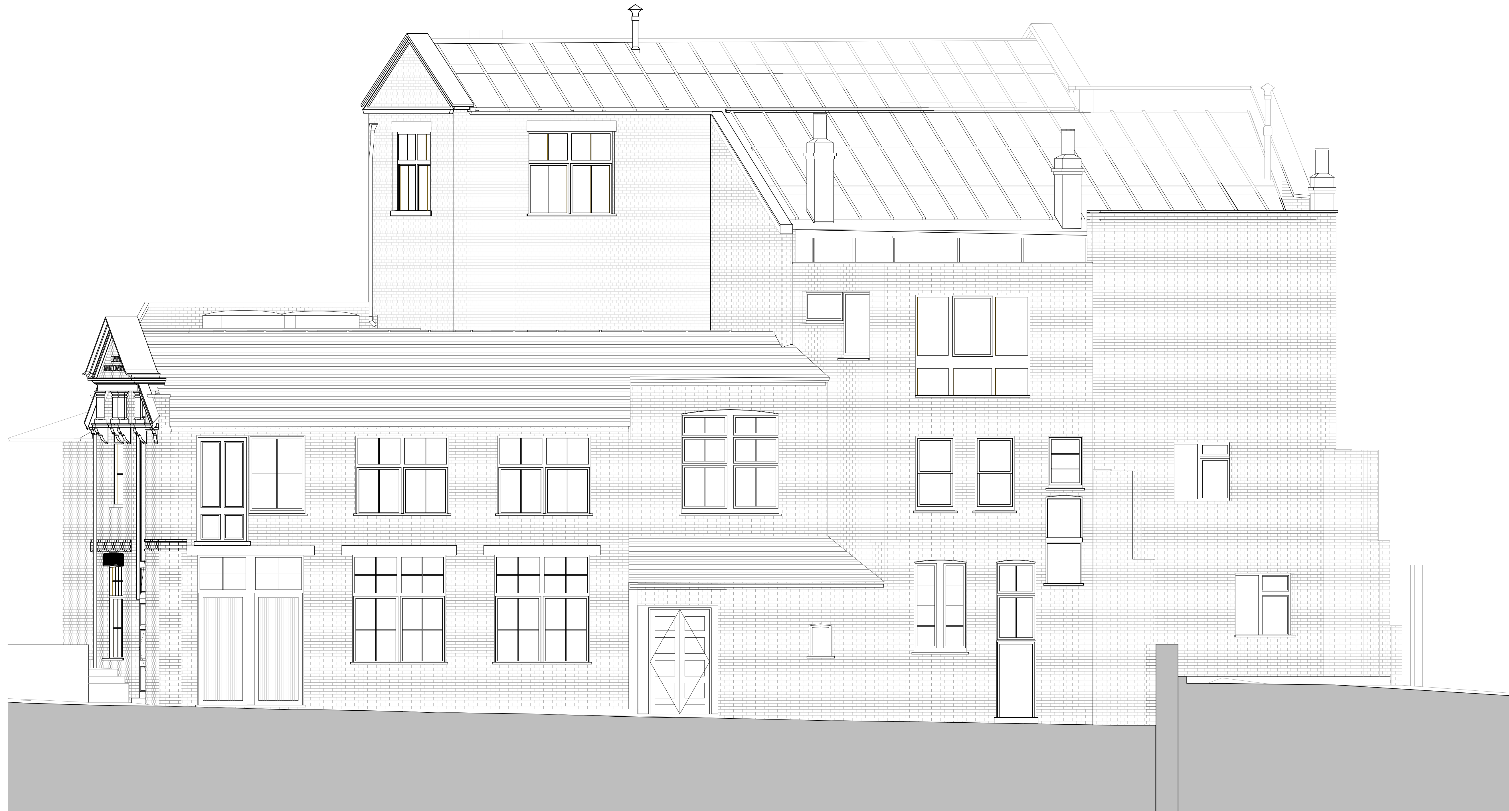
Existing Elevation A 1:50 at A1