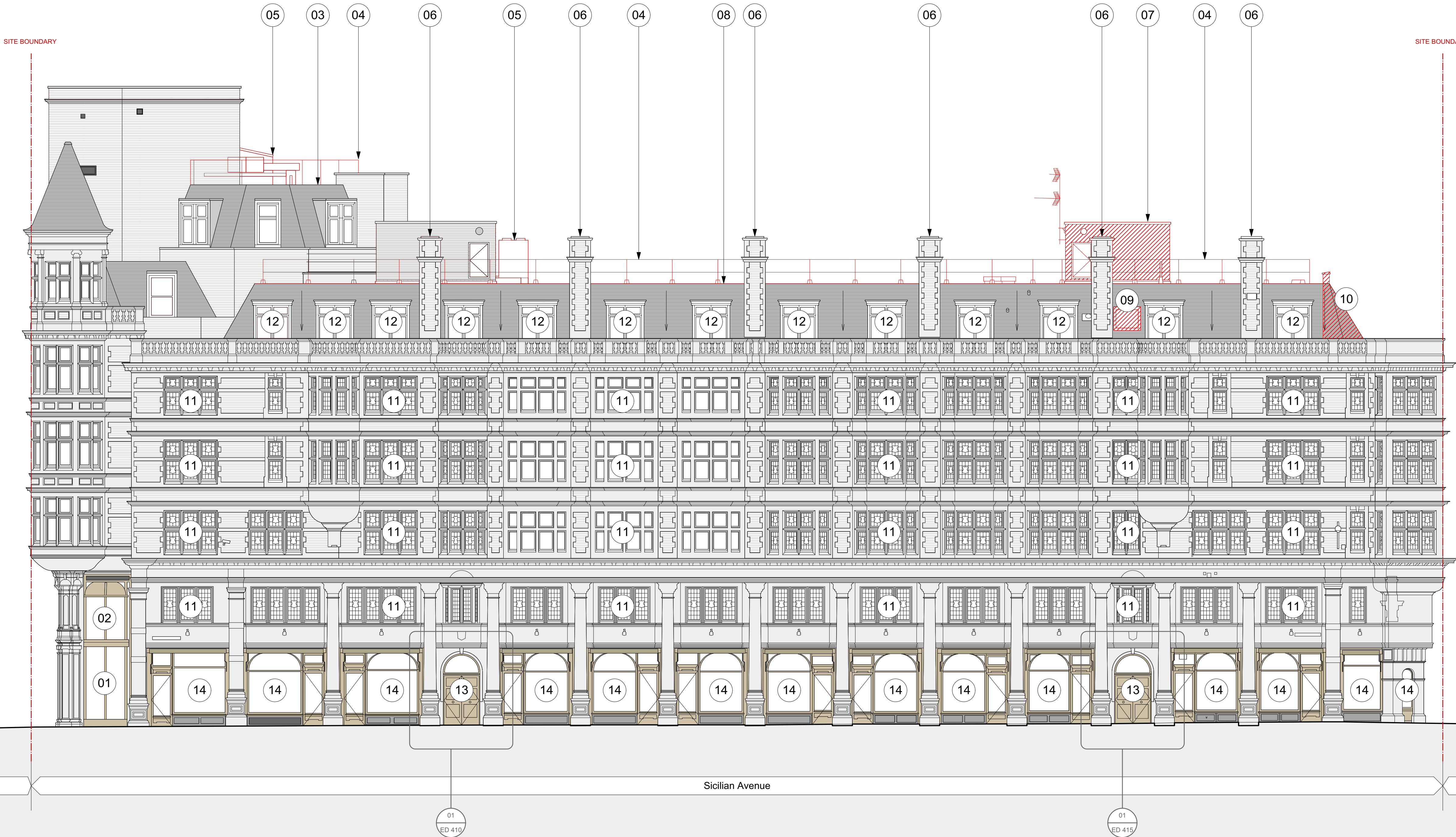
1 Vernon & Sicilian House Demolition North East Context Elevation Scale: 1:100