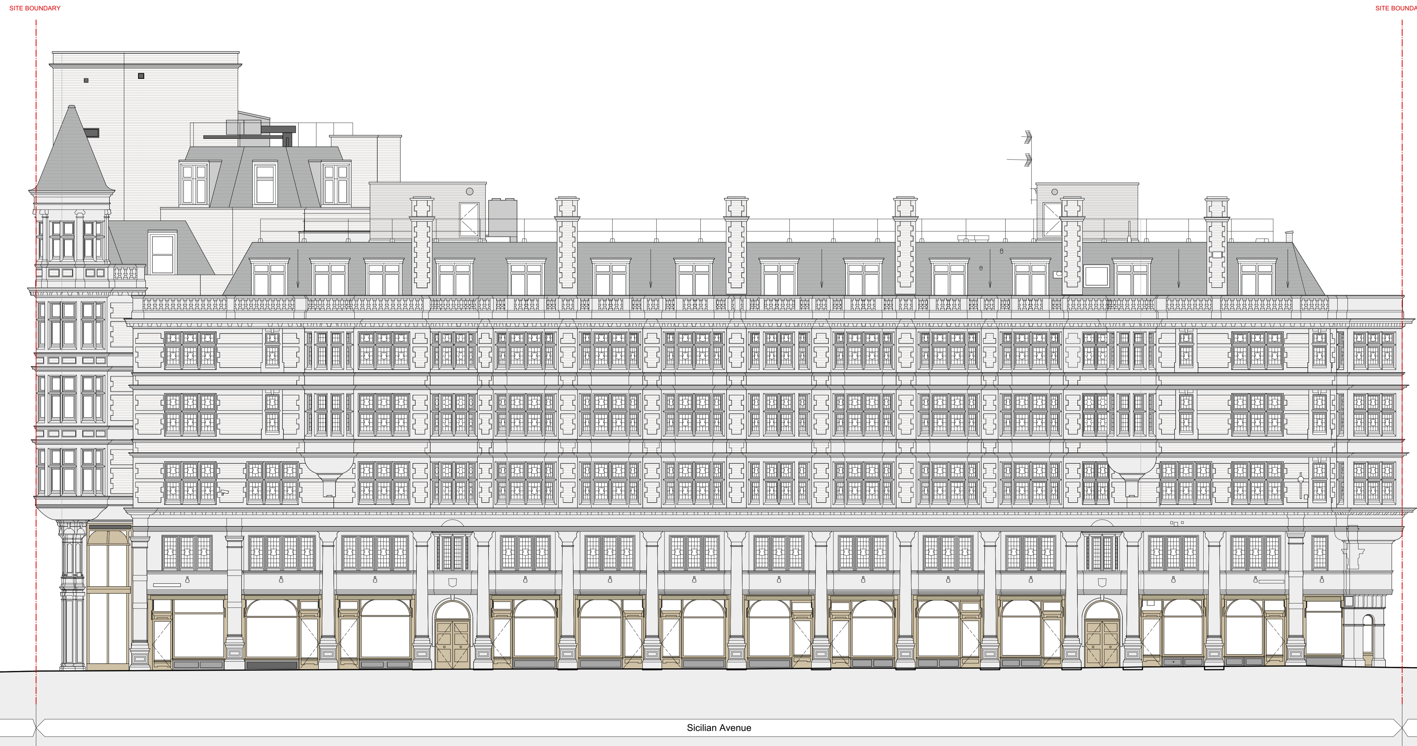
1 Vernon & Sicilian House Existing North East Elevation Scale: 1:100