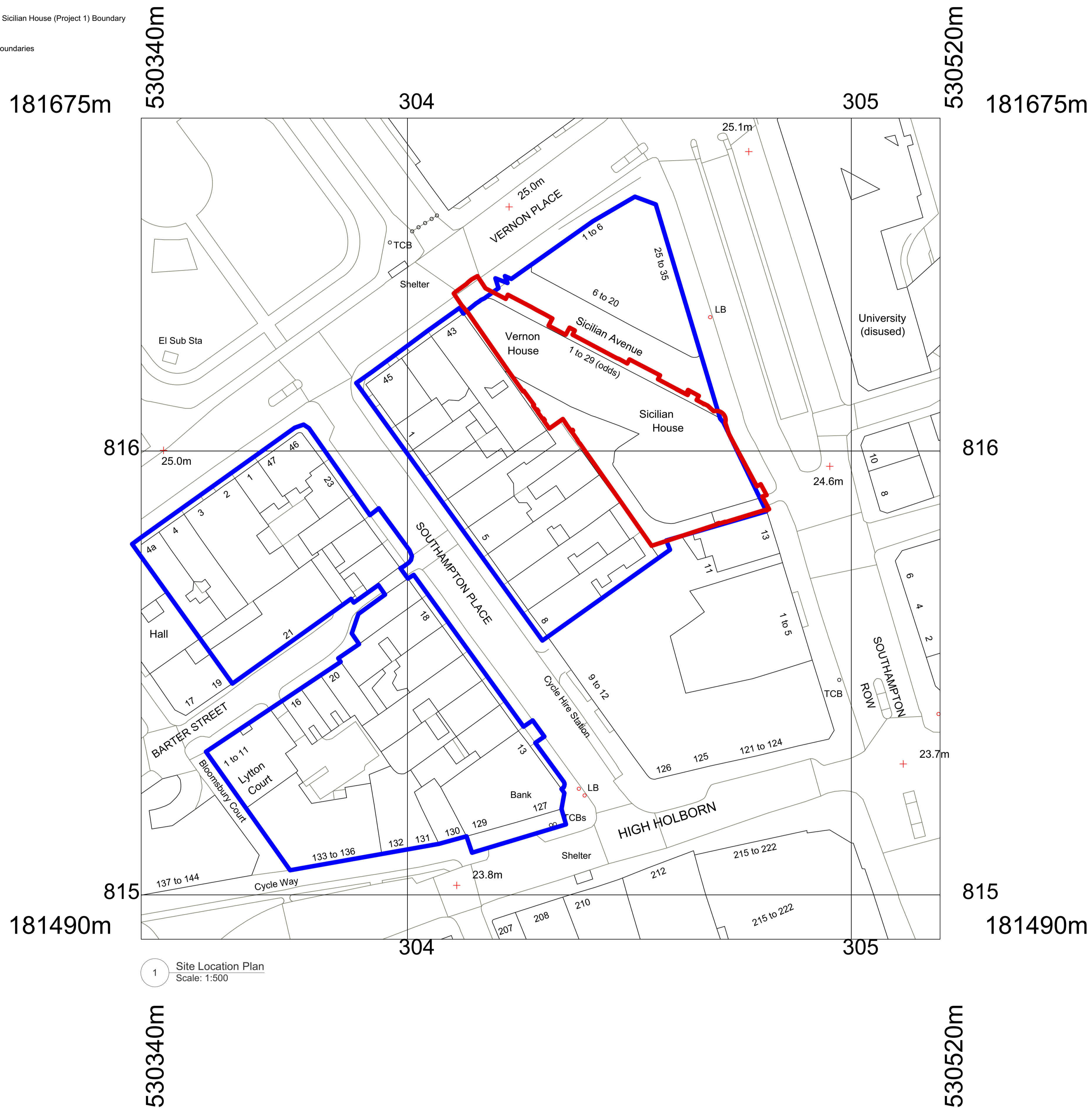
1 Site Location Plan Scale: 1:500