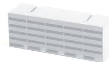
Glazed white air brick to match rear facade