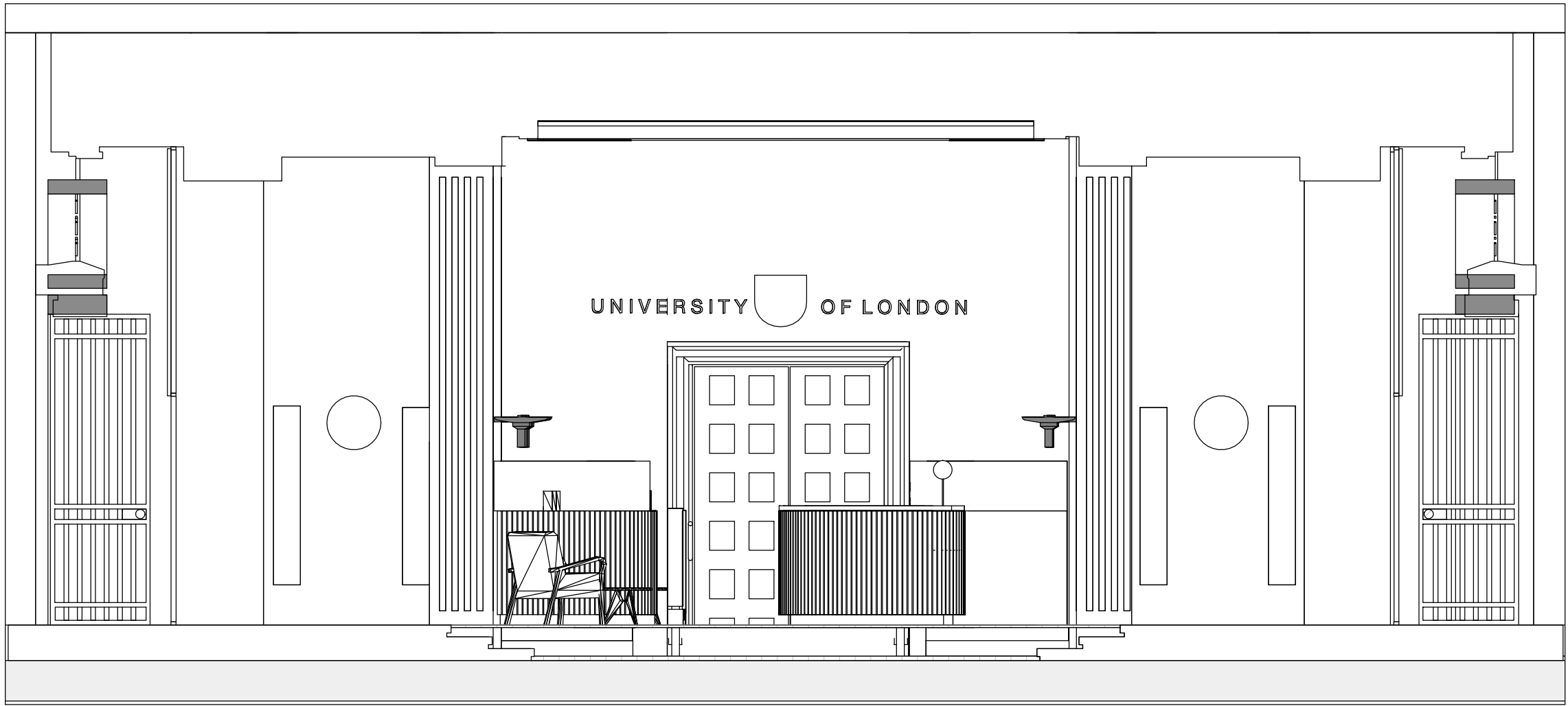
1 Proposed Internal Elevation B-B 1 : 50