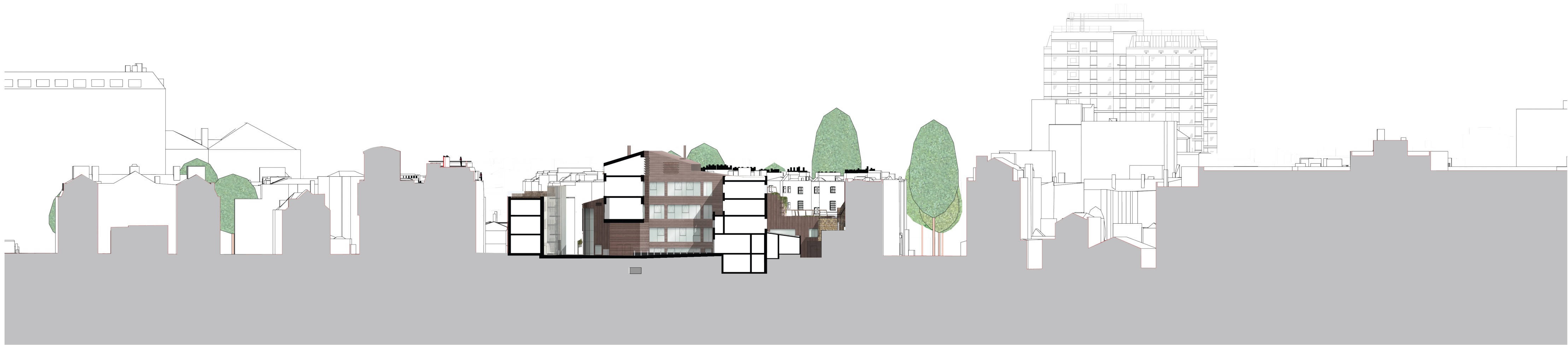
Site Section DD Scale 1:500

REFER TO SOUTH ELEVATION CHANGE MARK-UP AND WEST ELEVATION CHANGE MARK-UP FOR CHANGES.