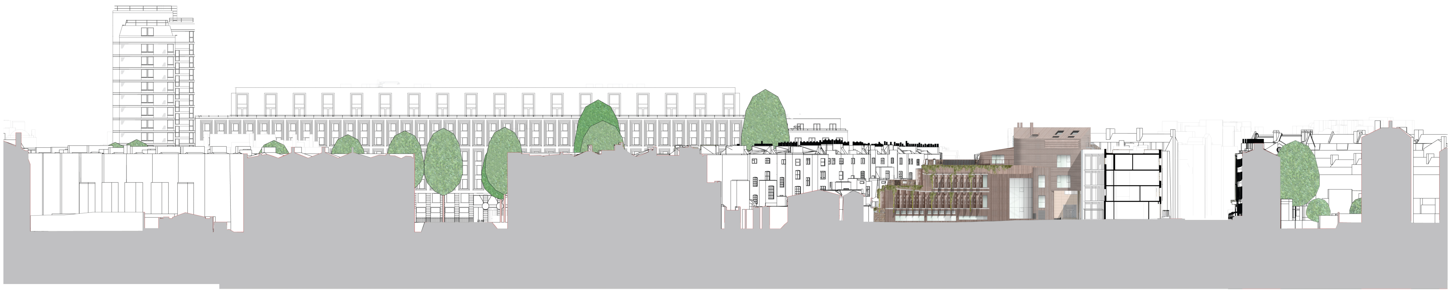
Site Section EE Scale 1:500