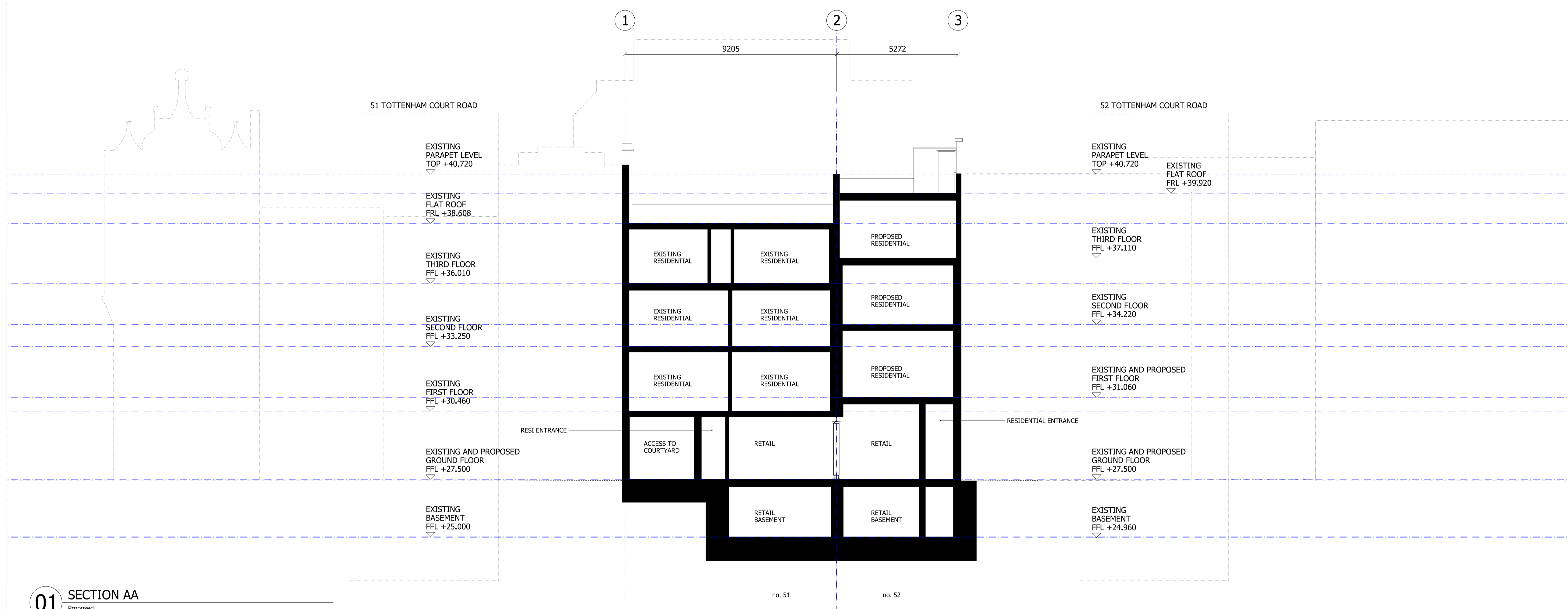
01 SECTION AA Proposed

SITE BOUNDARY - - - - - EXISTING WALLS - - - - -