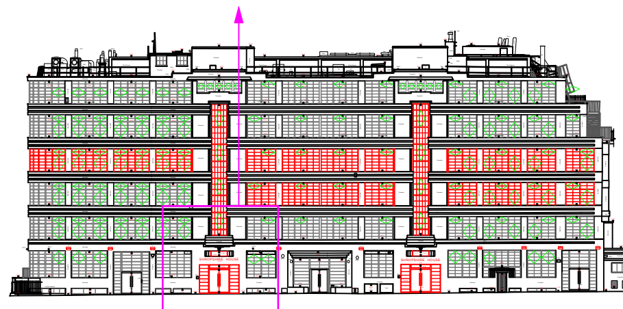
Existing Front Main Entrance Elevation East Shropshire House 1:50 @ A3

— Green indicates existing window openers — Red indicates demolition