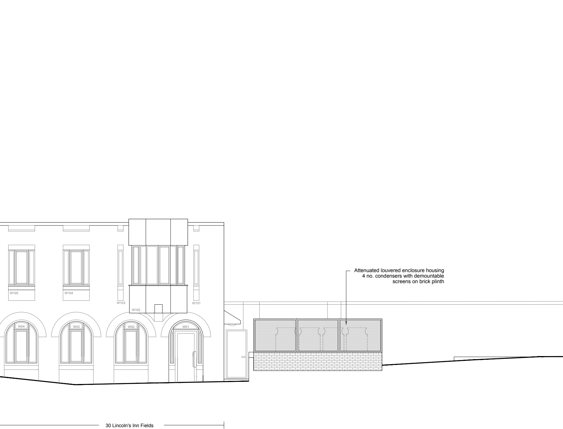
1. Proposed SE facing elevation Scale: 1/100