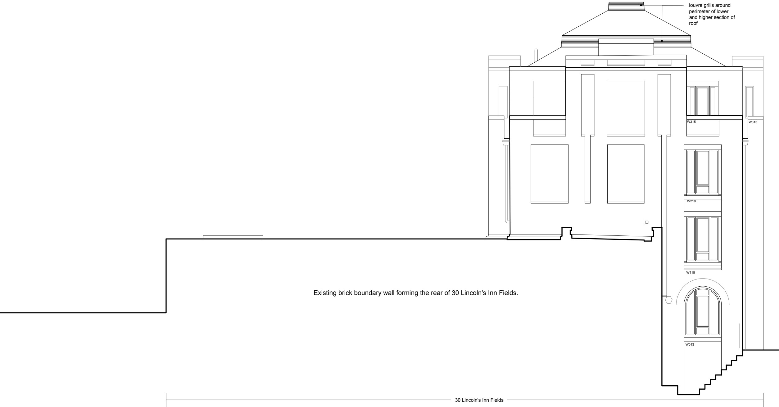
1. Proposed NW facing elevation - as viewed from behind boundary wall Scale:1/100