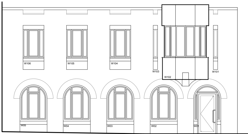
1. Proposed SE facing elevation Scale:1/100