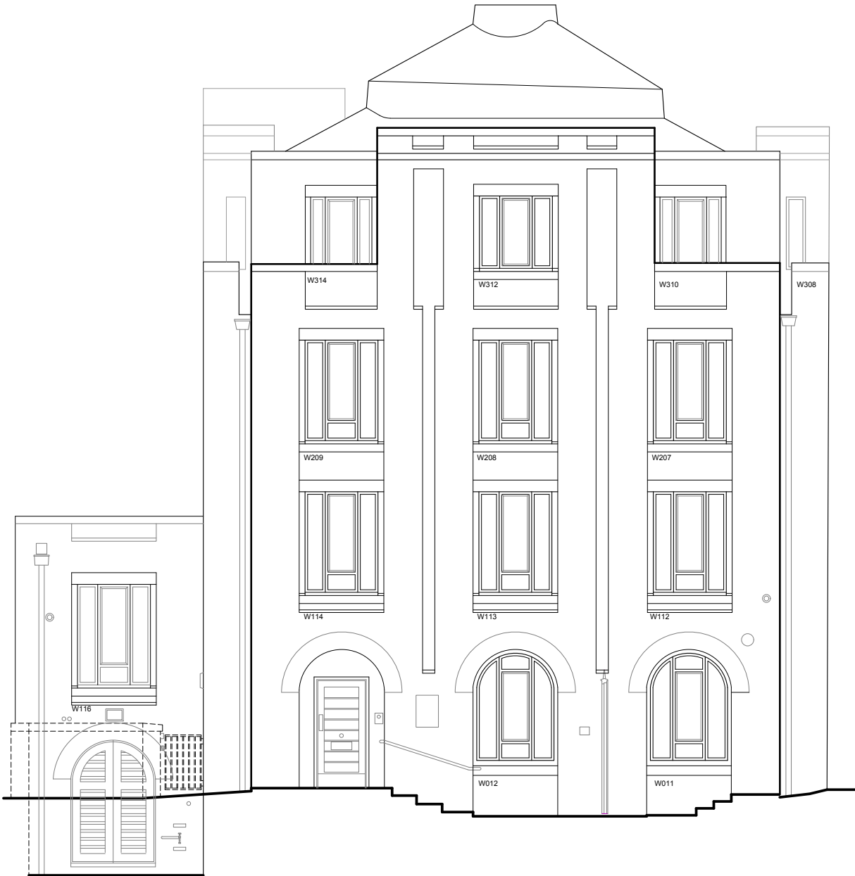
1. Proposed NW facing elevation Scale:1/100