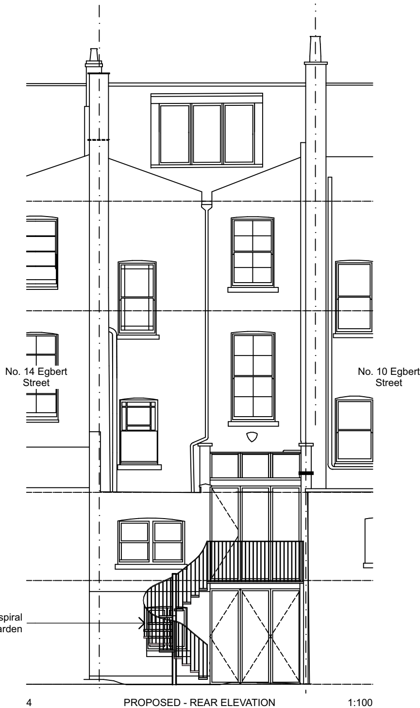
4 PROPOSED - REAR ELEVATION 1:100