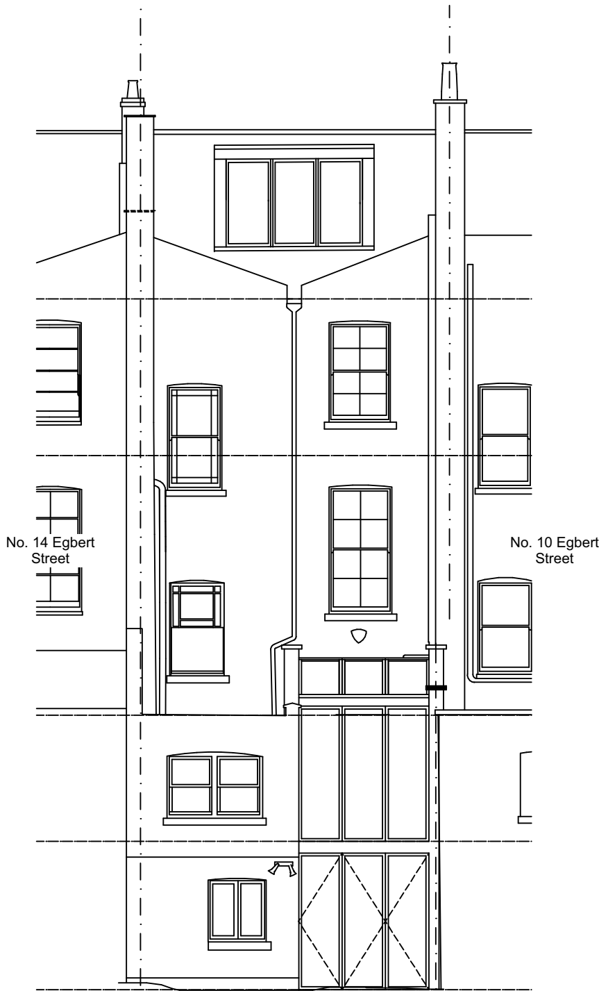
4 EXISTING - REAR ELEVATION 1:100