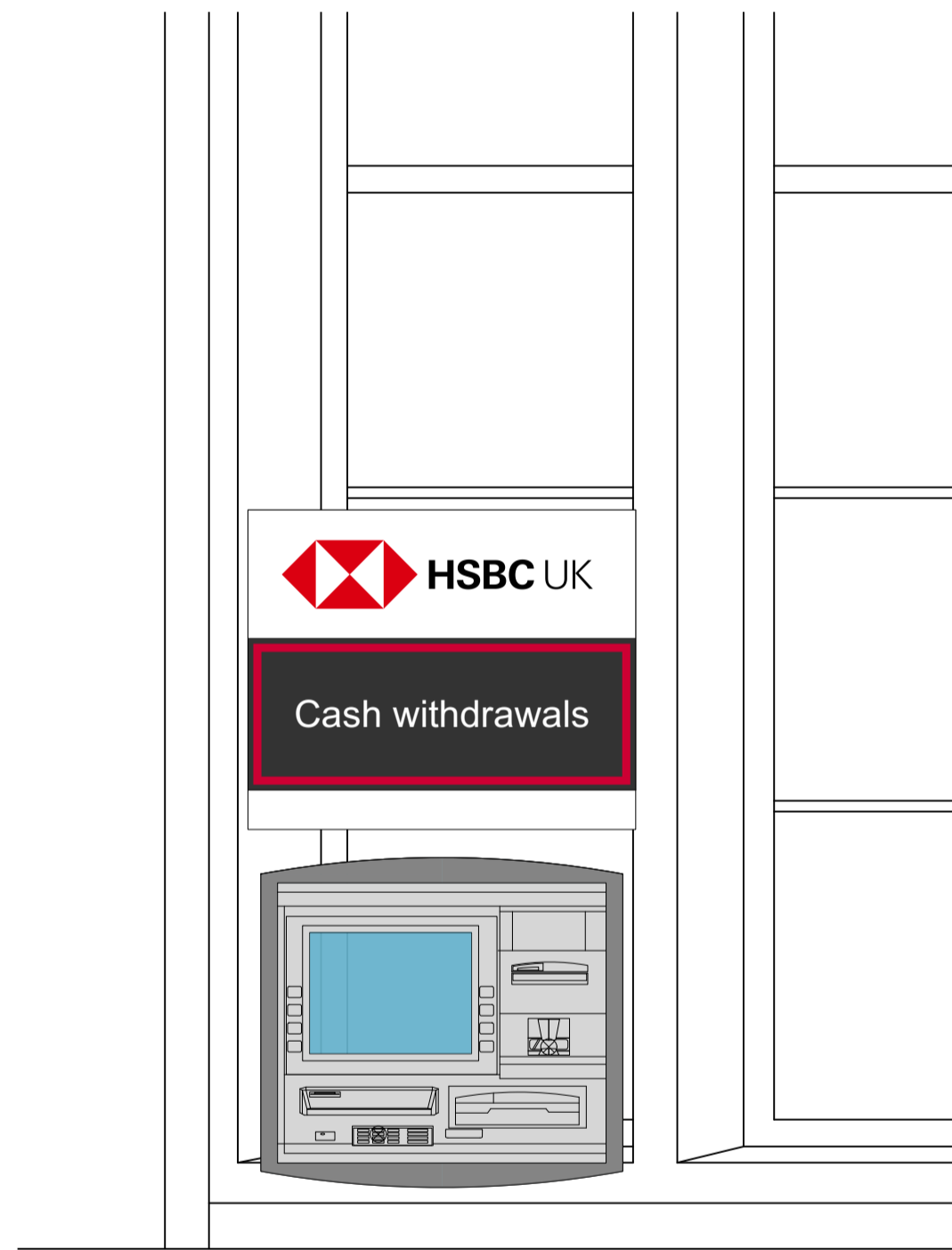
02 Detailed Elevation Of Affected Area 1:25@A3 / 1:12.5@A1