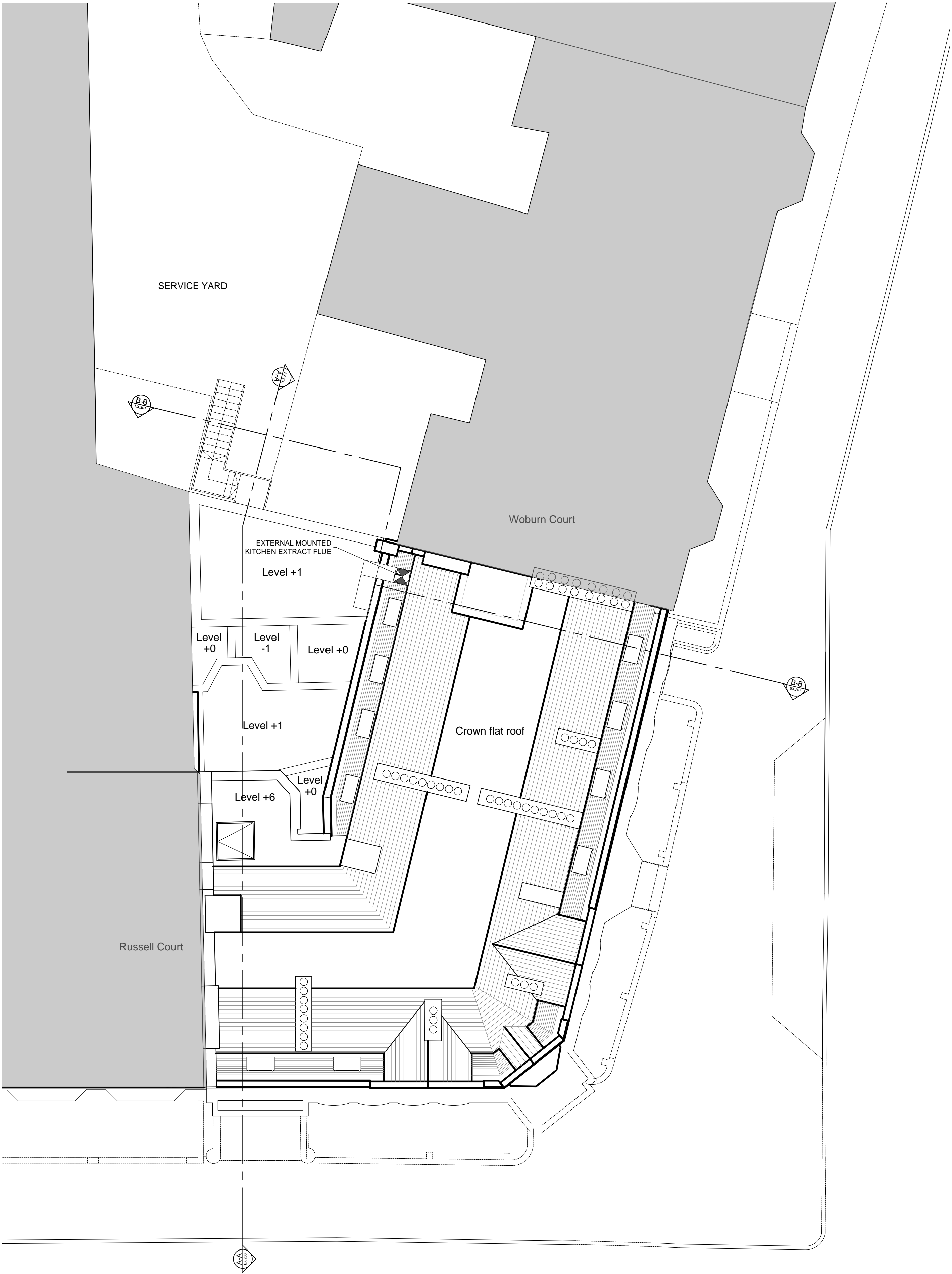
PROPOSED ROOF PLAN Level + 6 Scale 1:100

This drawing must not be reproduced without permission. Do not scale from drawing. Contractor to check all dimensions on site. Report discrepancies to the architect.