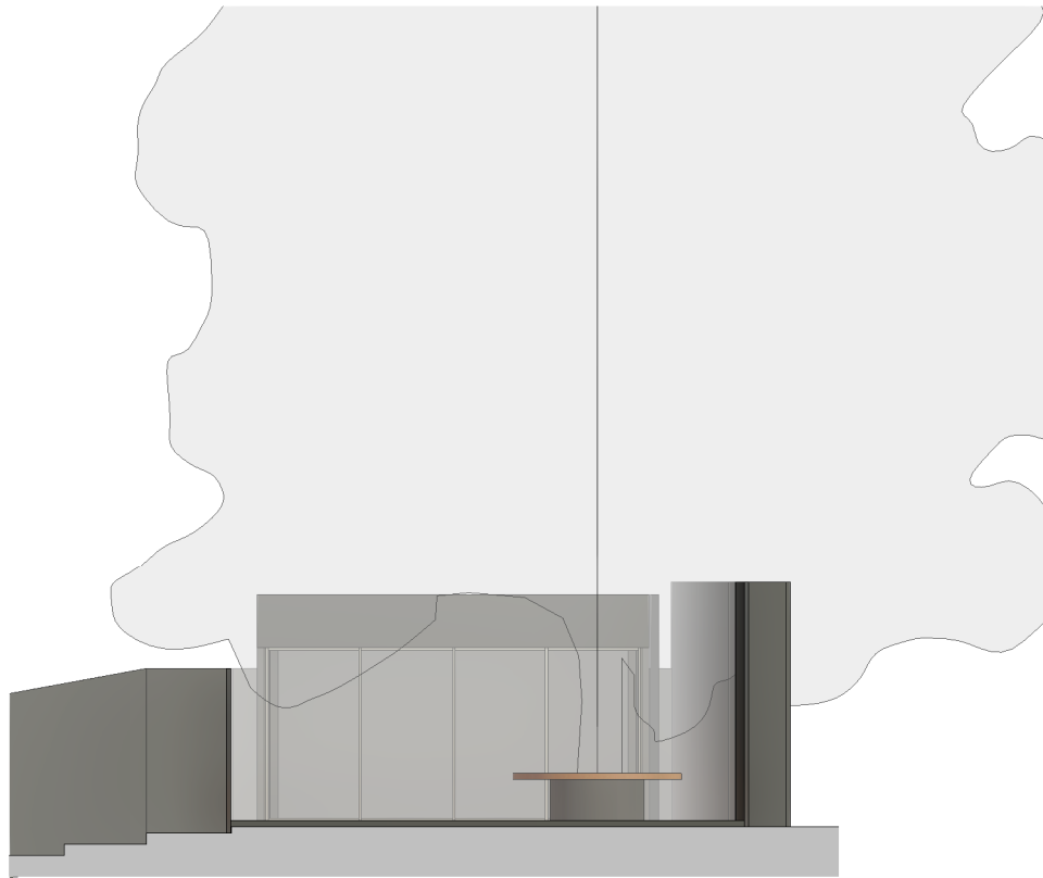
04 Elevation D 1 : 100