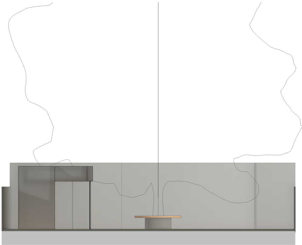
01 Elevation A 1 : 100