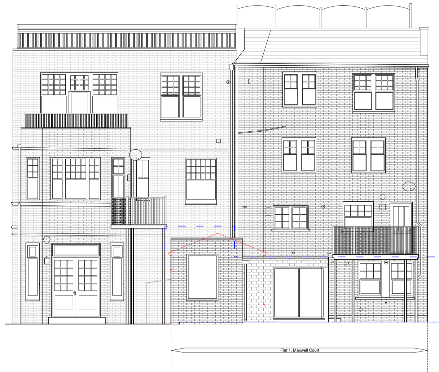
1 Proposed South Elevation Scale: 1:100