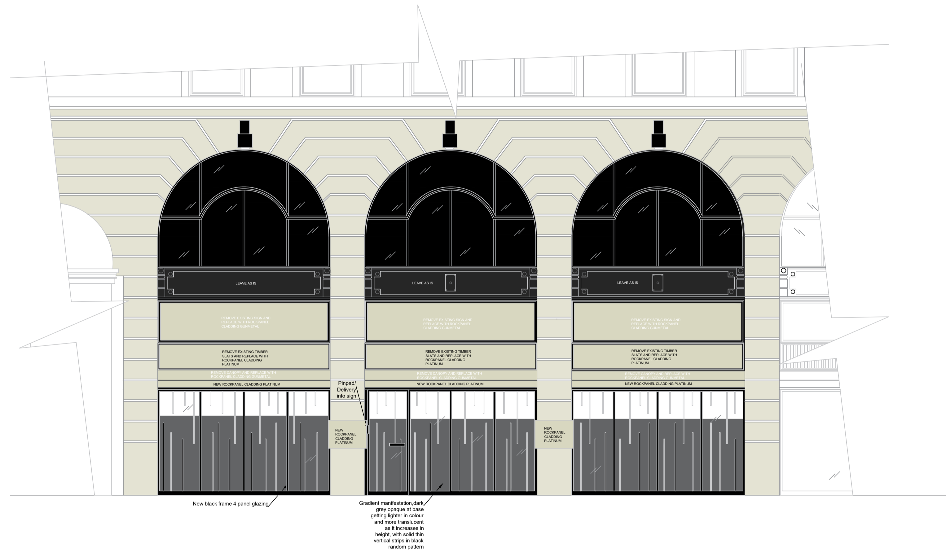
04-009 PROPOSED FRONTAGE 1:50 SCALE