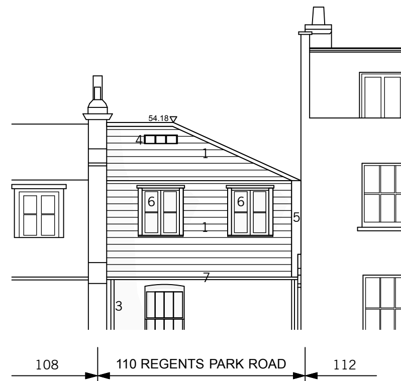
2. PROPOSED REAR ELEVATION