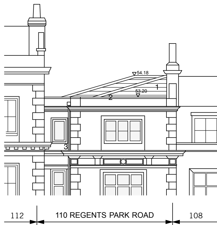
1. PROPOSED FRONT ELEVATION