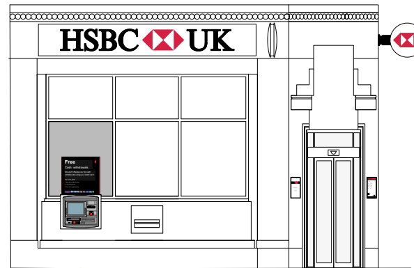
04 Existing Elevation 1:100@A3