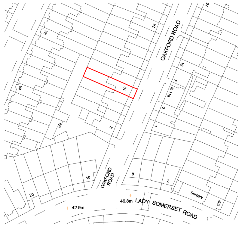
LOCATION PLAN 1 : 1250 @A3