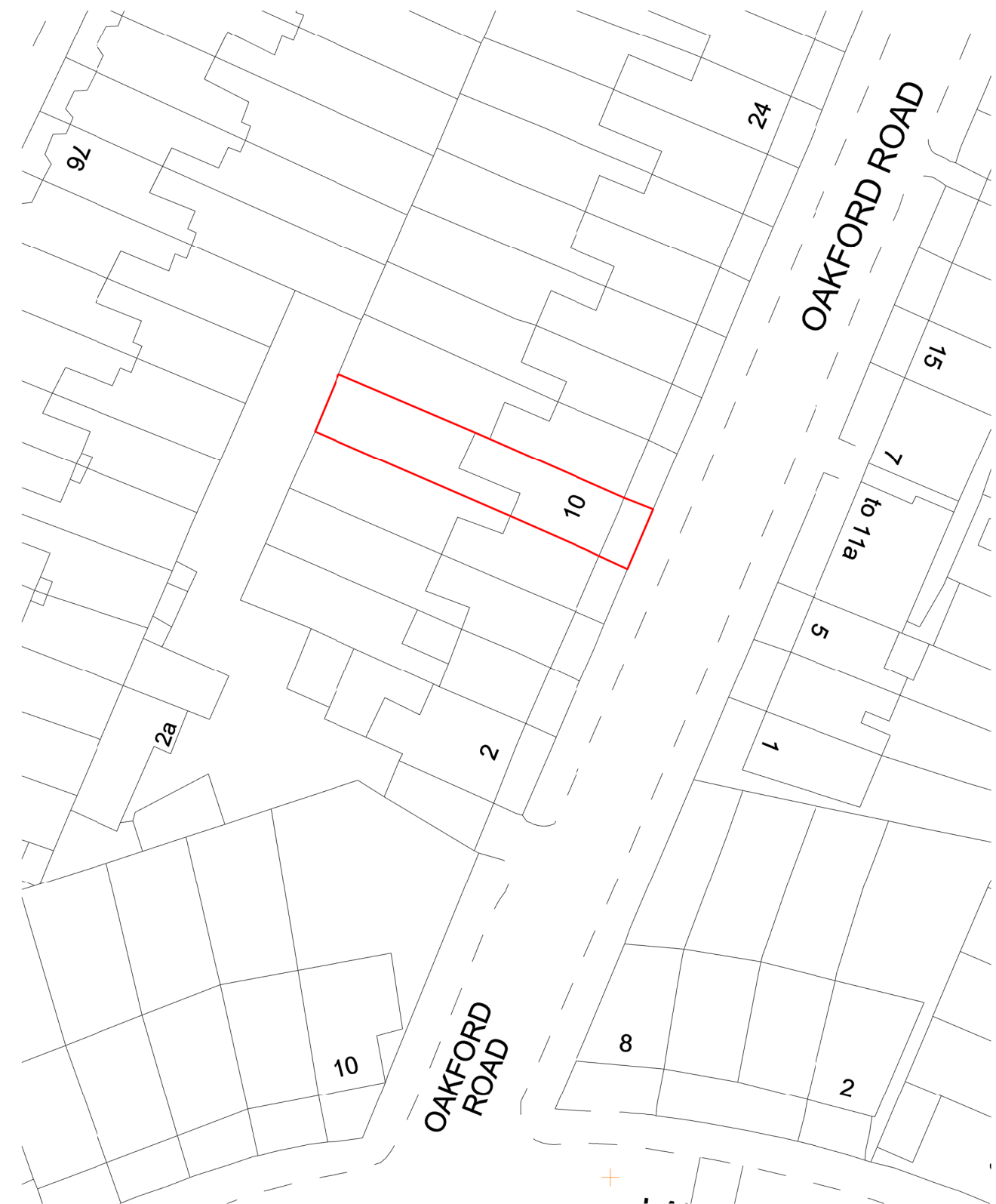
BLOCK PLAN 1 : 500 @A3