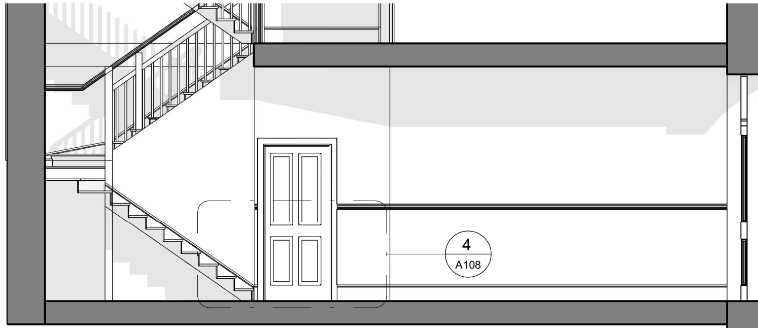
① Proposed Section C-C 1 : 50