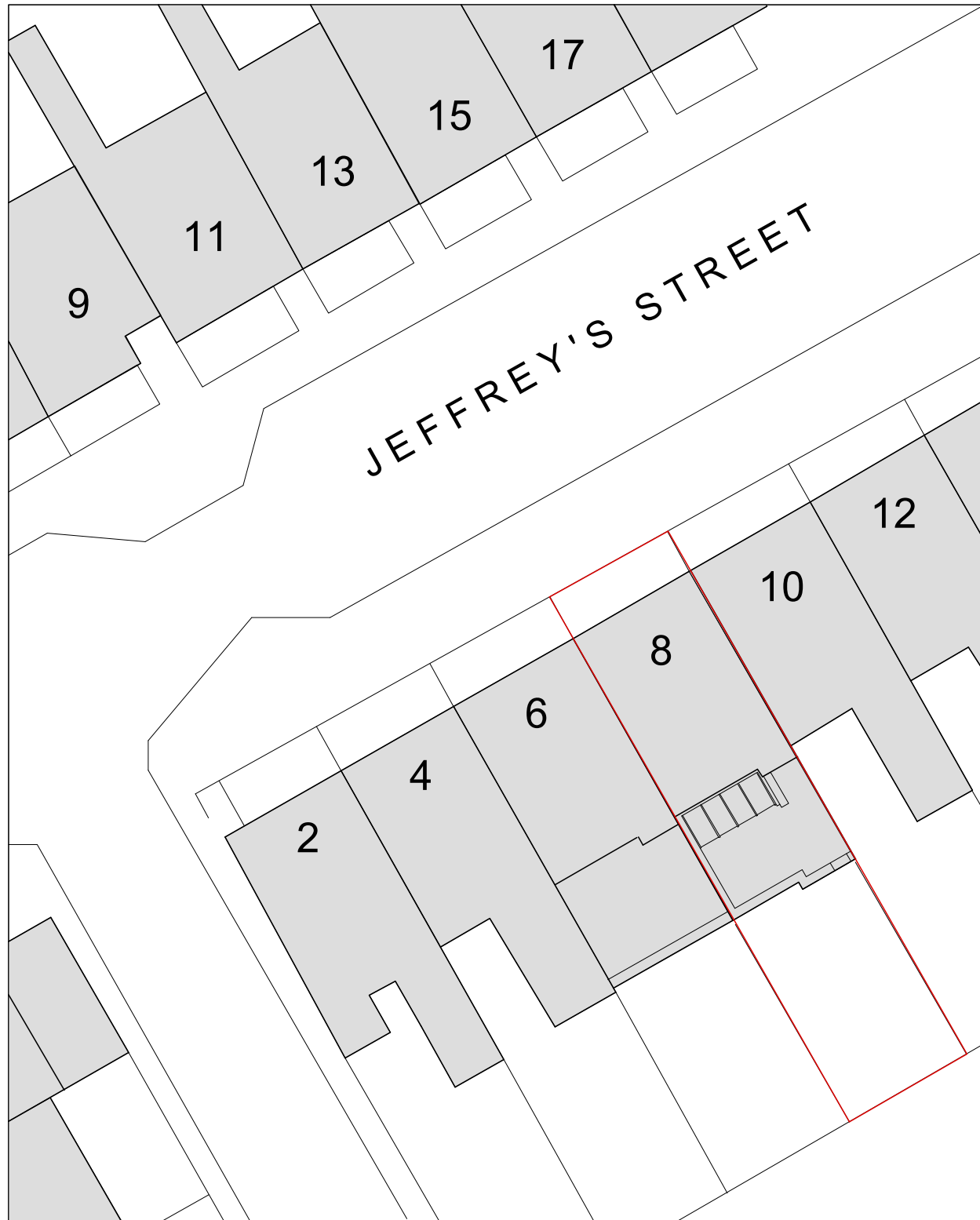
BLOCK PLAN 1:200