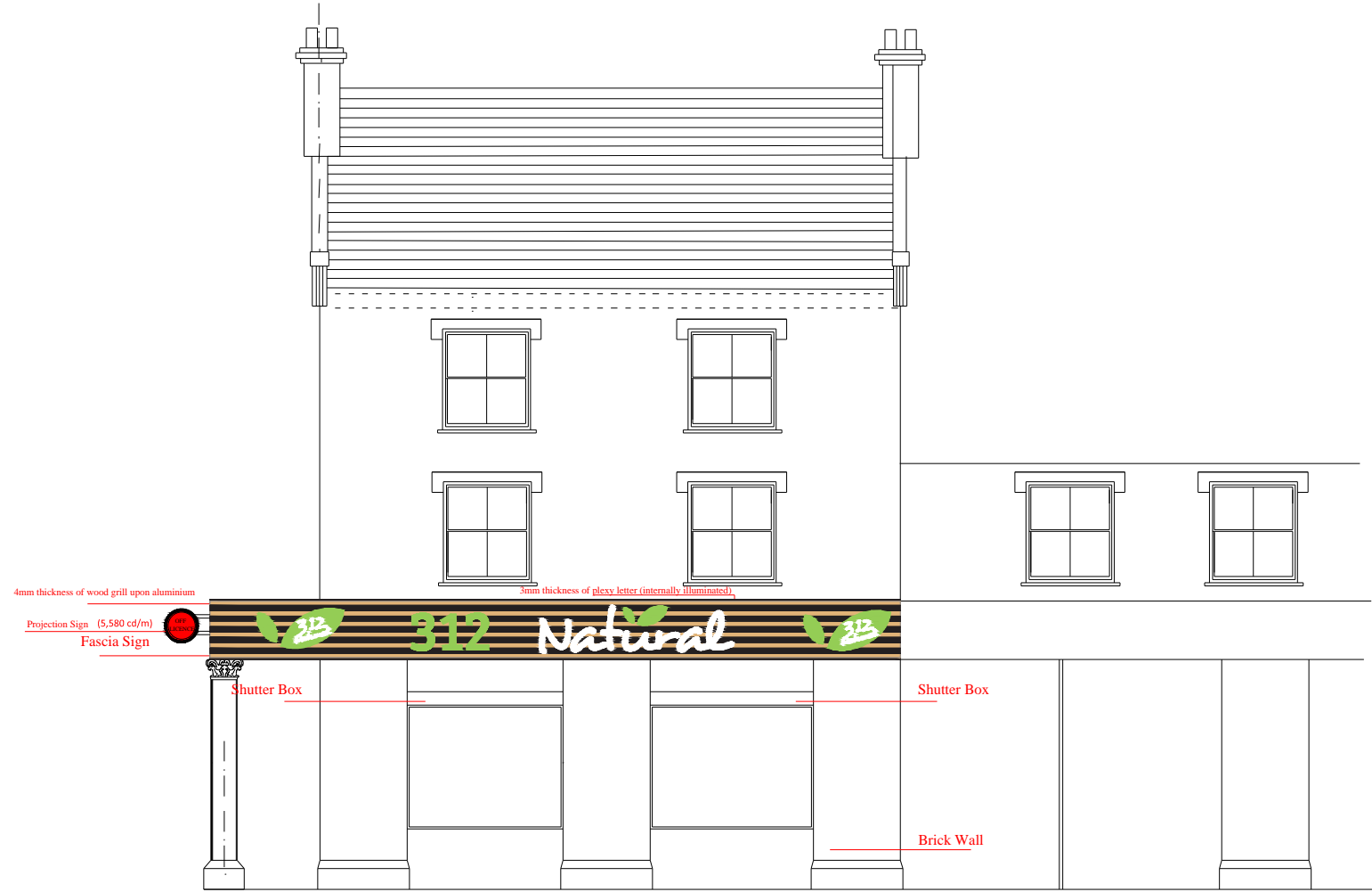
Gordon House Road Elevations