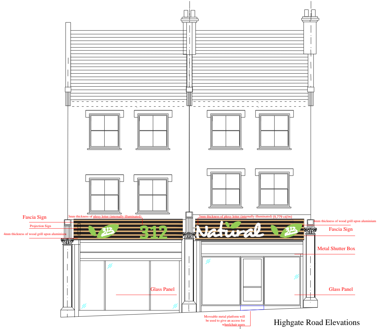
Highgate Road Elevations