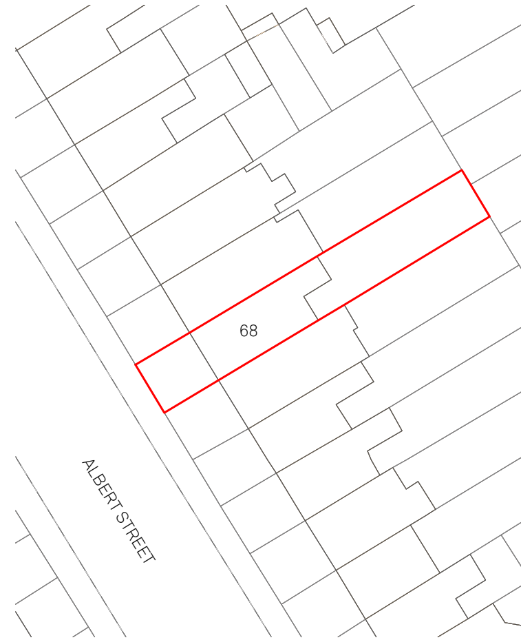
SITE PLAN 1:1250

- 03/12/21 AS/BR PLANNING - first issue REV DATE DRAWN/CHK DESCRIPTION