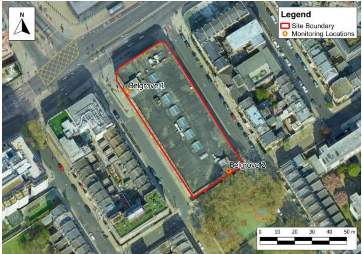
Figure 1: Monitoring Locations