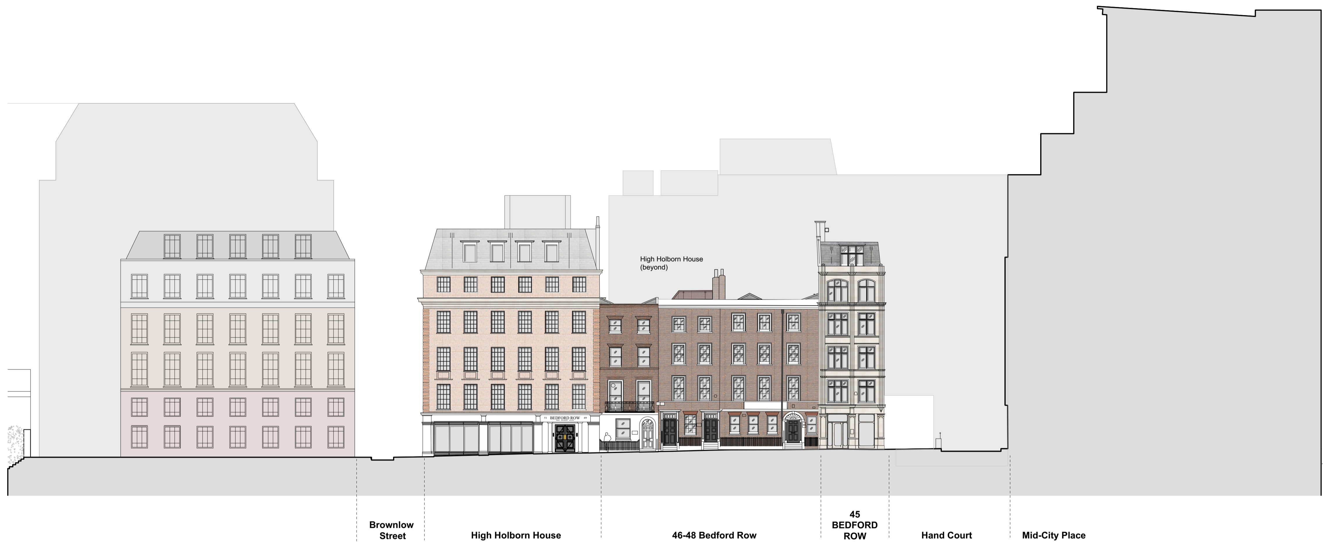
1 Existing Elevation C-C / Bedford Row 1:200 at A1

GENERAL NOTES. © Buckley Gray Yeoman Limited All dimensions to be checked on site prior to commencement of any works, and/or preparation of any shop drawings. Sizes of and dimensions to any structural elements are indicative only. See structural engineers drawings for actual sizes / dimensions. Sizes of and dimensions to any service elements are indicative only. See service engineers drawings for actual sizes and dimensions. This drawing to be read in conjunction with all other Architect's drawings, specifications and other Consultants' information. All proprietary systems shown on this drawing are to be installed strictly in accordance with the Manufacturers/Suppliers recommended details. Any discrepancies between information shown on this drawing and any other contract information or manufacturers/suppliers recommendations is to be brought to the attention of the Architect DO NOT SCALE FROM THIS DRAWING. NOTES.