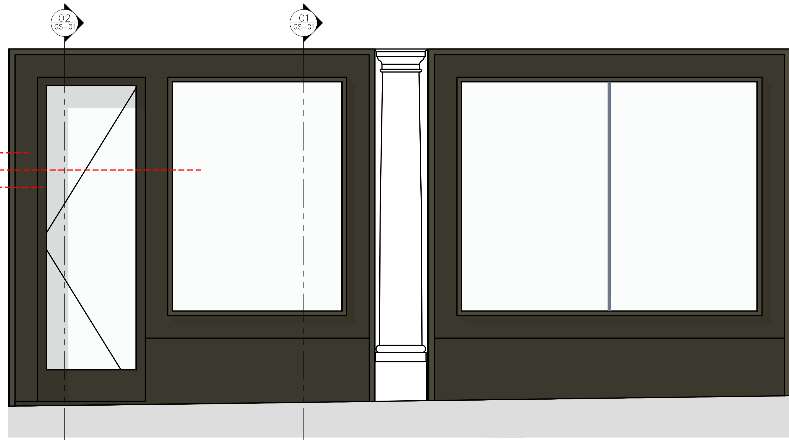
3 BROWNLOW STREET - ELEVATION REFERENCE SCALE 1:20