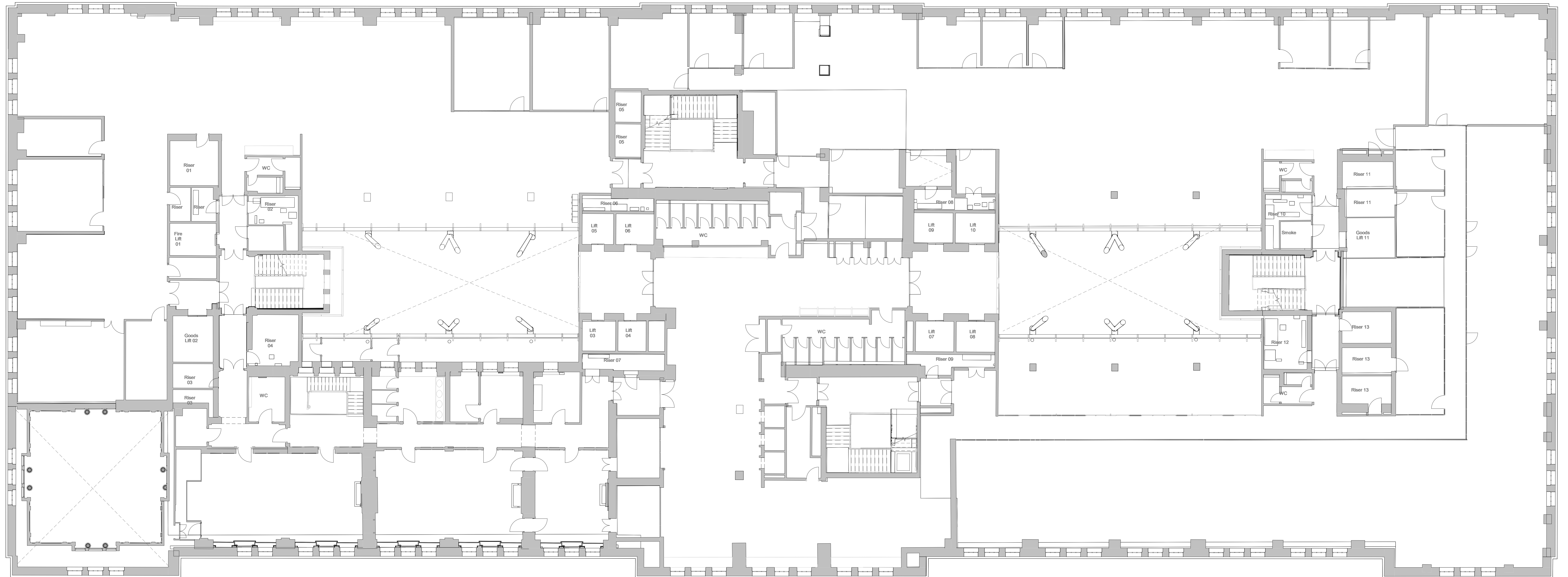
1 Existing Fourth Floor Plan 11/199