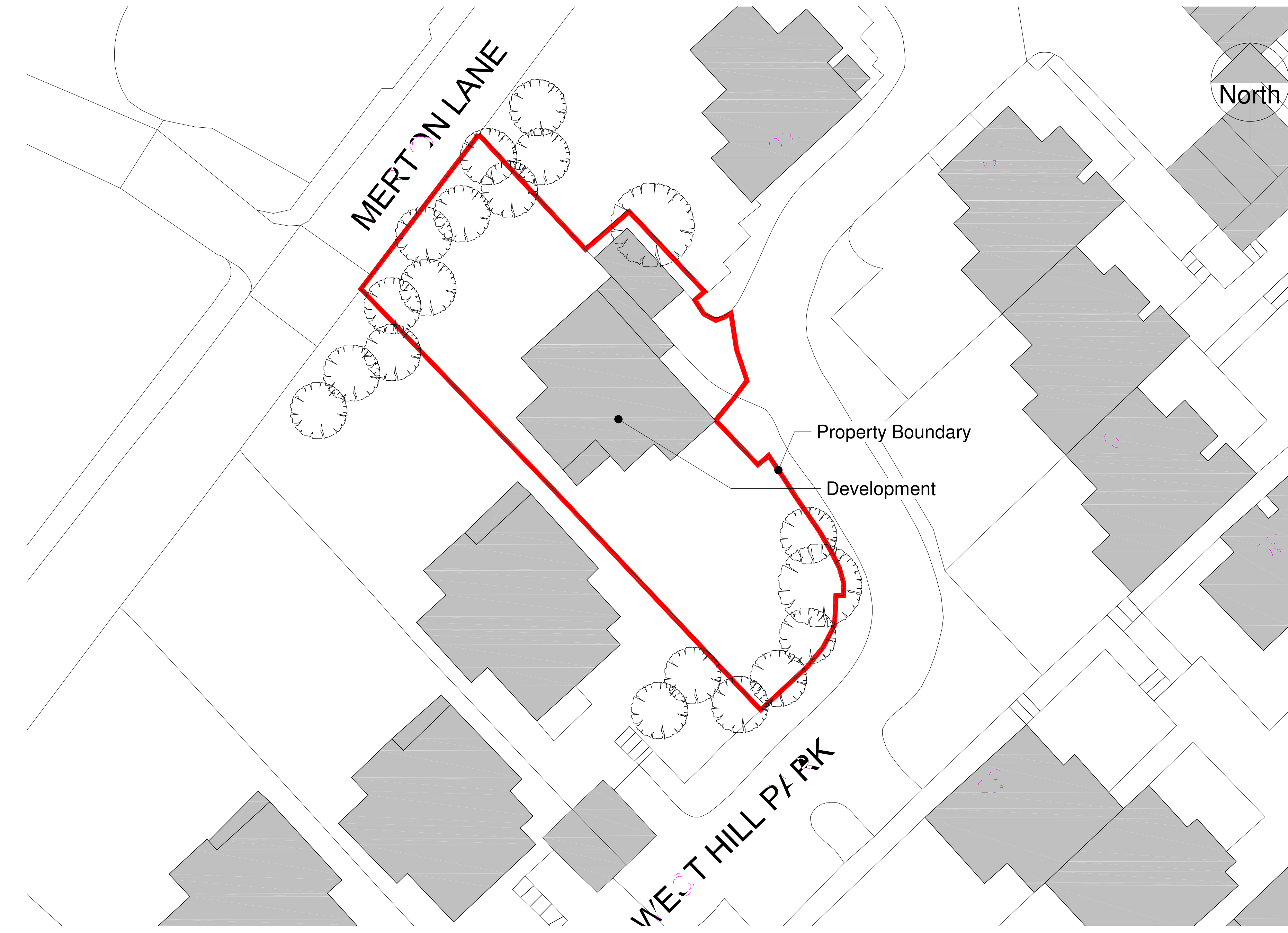
Location Plan 1:200 2 0 2 4 6 8 10 SCALE 200 m 1: