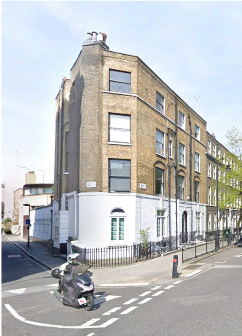
Street View of 1 Doughty Street, London, WC1N 2PH