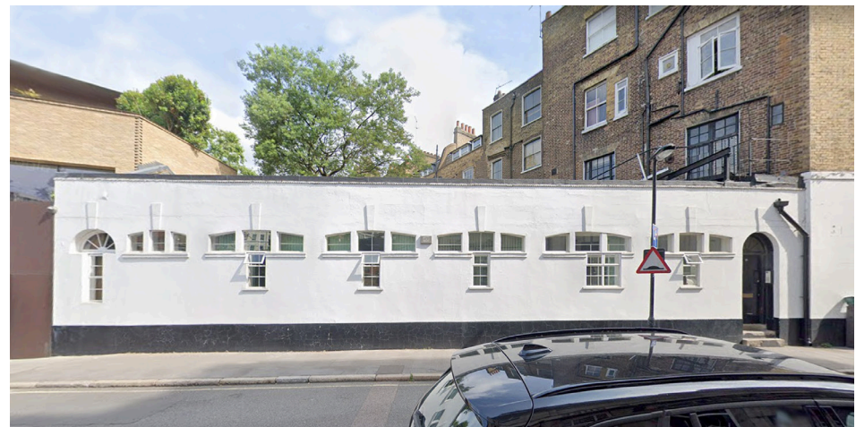
Street Views of 1 Roger Street, London, WC1N