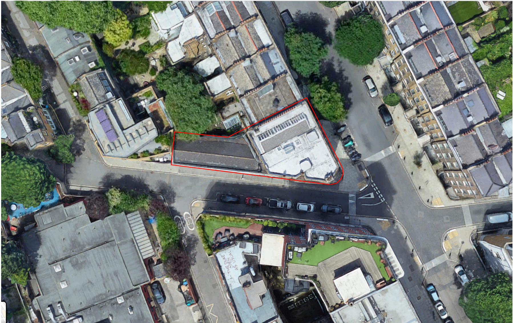
Existing Aerial Site View of 1 Doughty Street, London, WC1N 2PH