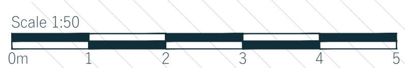
1 Existing Ground Floor Plan Scale 1:50