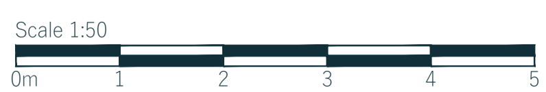
1 Existing Fourth Floor Plan Scale 1:50