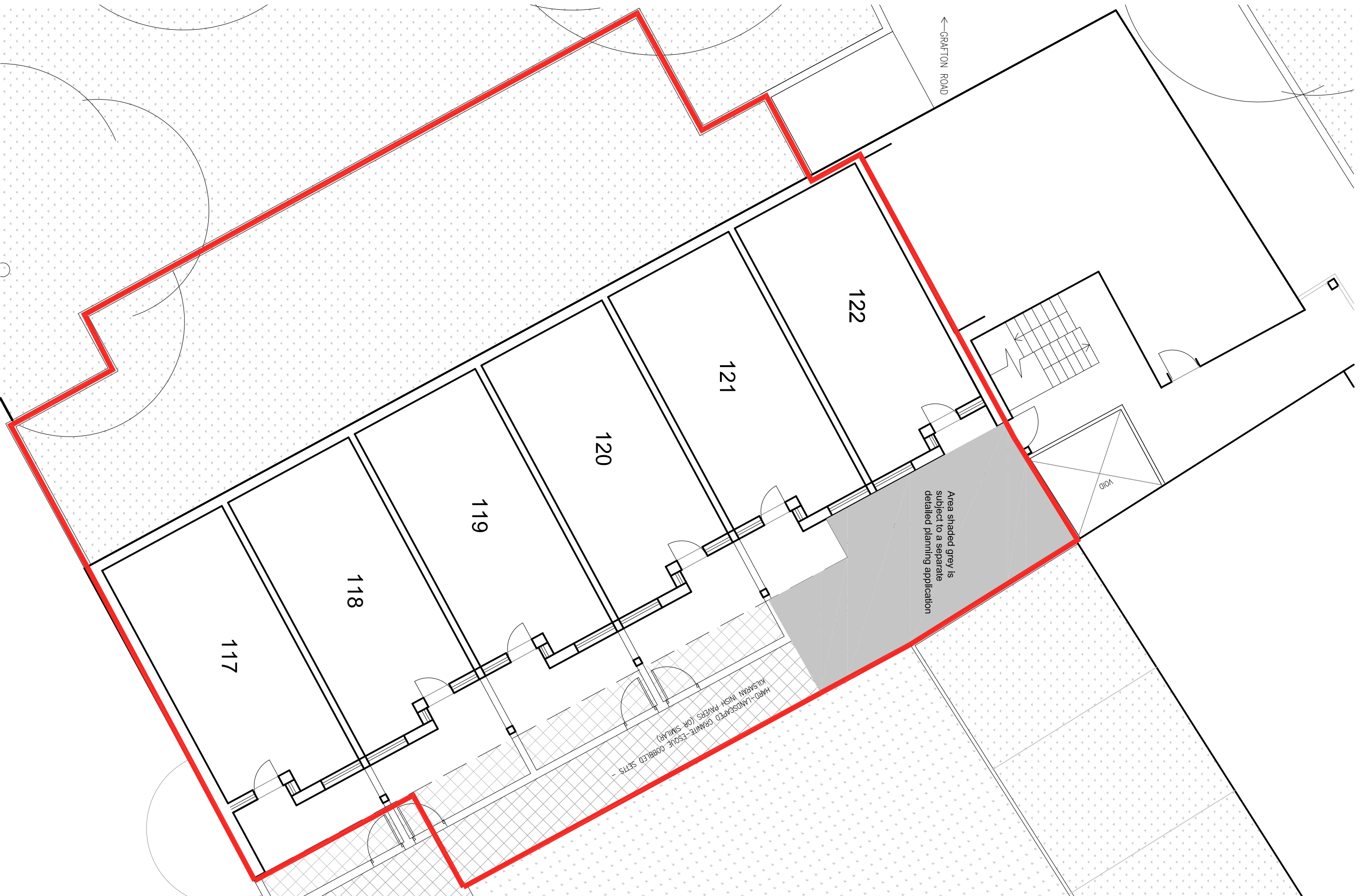
REVISED RED LINE

— DEVELOPMENT BOUNDARY AREA SHADED GREY IS SUBJECT TO A SEPARATE DETAILED PLANNING APPLICATION